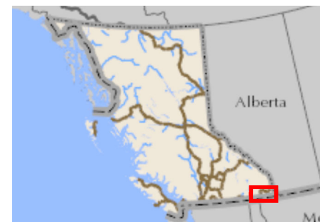
Key Map of British Columbia