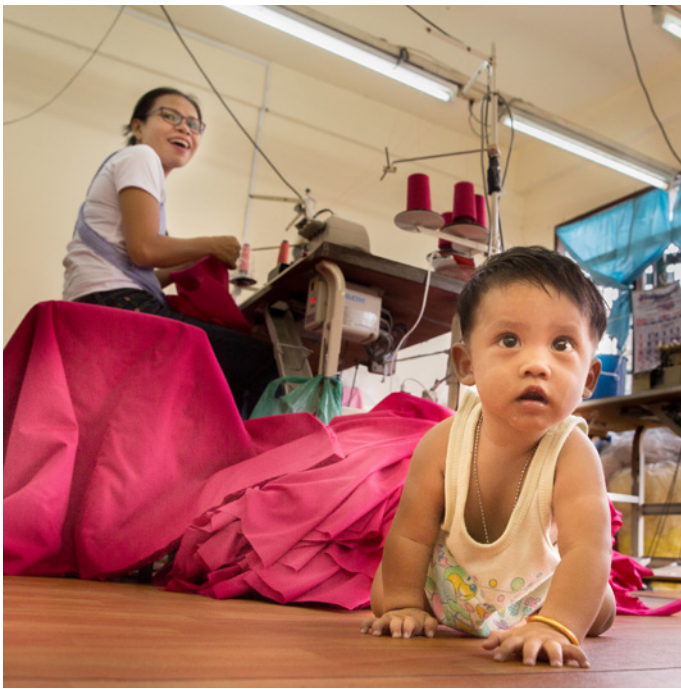
A 6-month-old child plays on the floor of the garment factory where her mother works in Bangkok, Thailand.

A sentiment that arose out of several of the focus groups was that the responsibility for child care should be seen as part of a public, collective responsibility because women simply did not have time to both provide income and adequate care for their children. In Brazil, the research participants suggested that it was the responsibility of the state to support working women with more comprehensive social policies with respect to the care of children. They argued for more child care centres running for extended hours during the day, but also for the provision of additional health and education programmes to compensate for the time that mothers are unable to spend with their children [Brazil FG1]. Indian women who sent their children to the SEWA child care centres echoed these sentiments, feeling that they had neither the time nor the energy to impart good values and behaviour and basic education to their children; they really appreciated that the centres were able to do this for them [India FG Report].