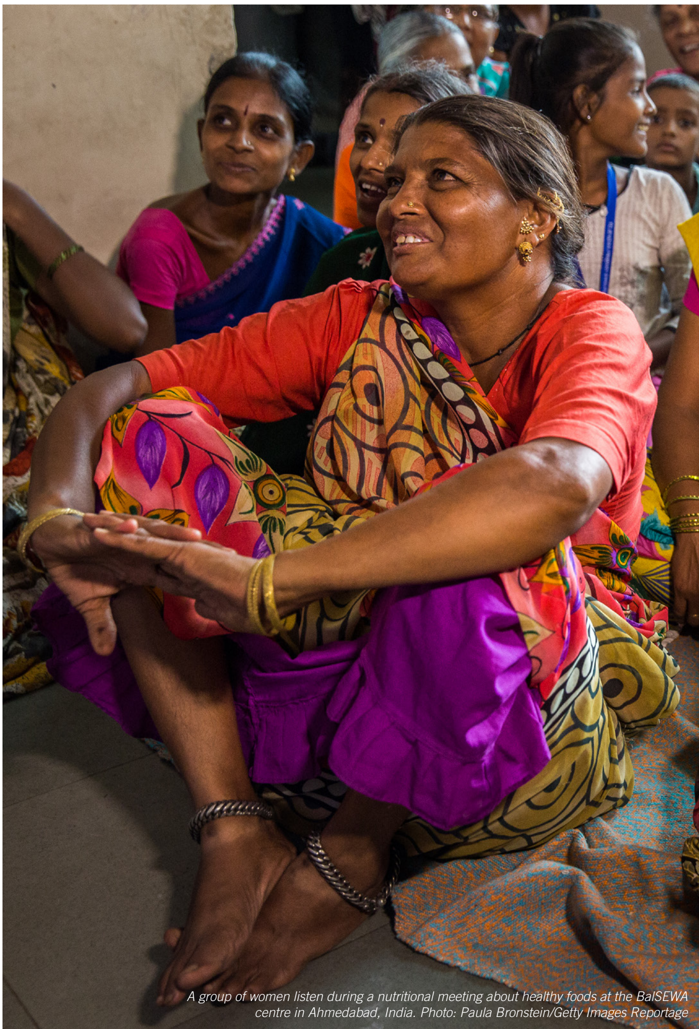
A group of women listen during a nutritional meeting about healthy foods at the BalSEWA centre in Ahmedabad, India.

“Our children do not get the attention they deserve”