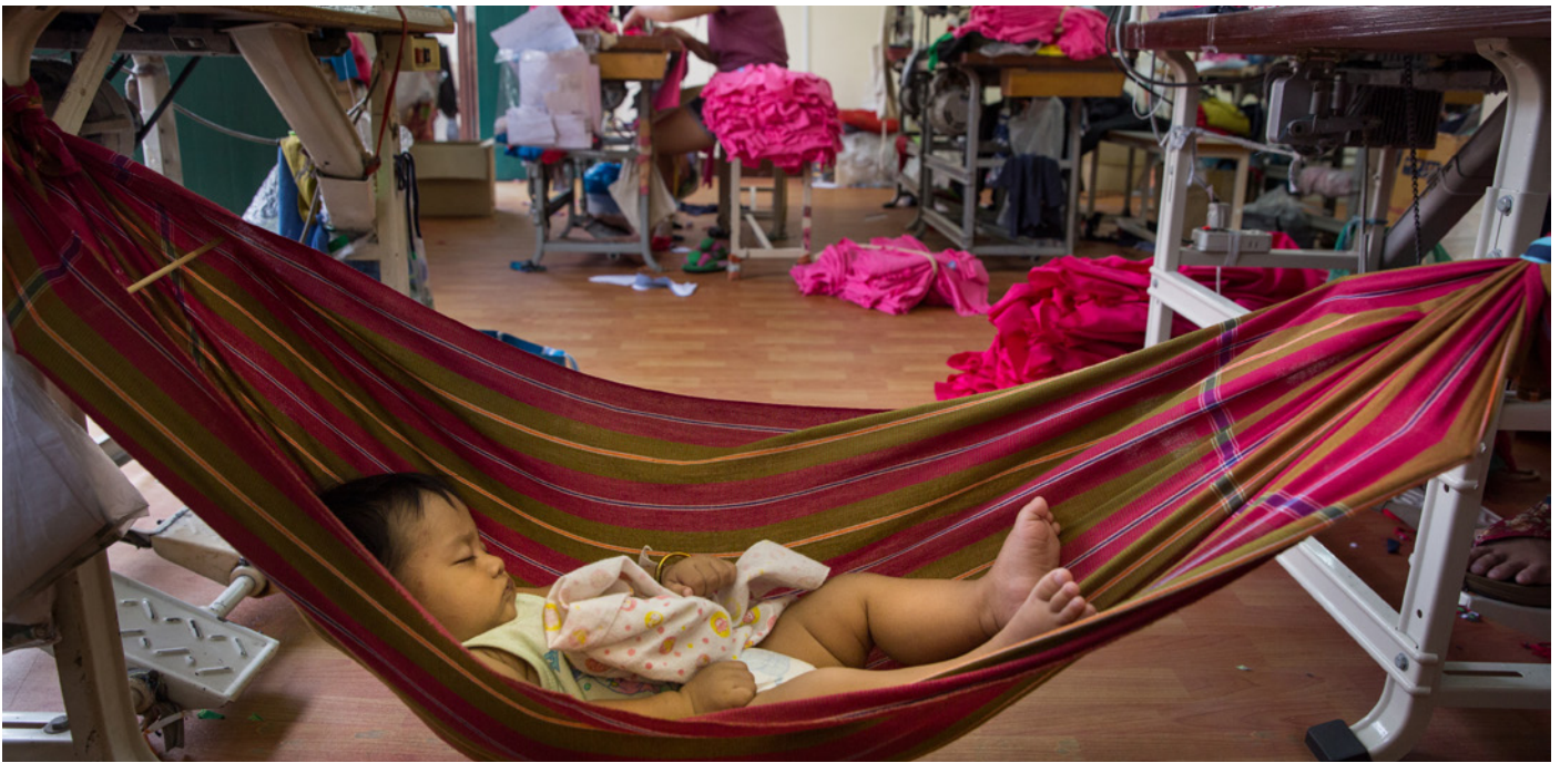
The 6-month-old child of a garment worker naps while her mother sews at a garment factory in Bangkok, Thailand.