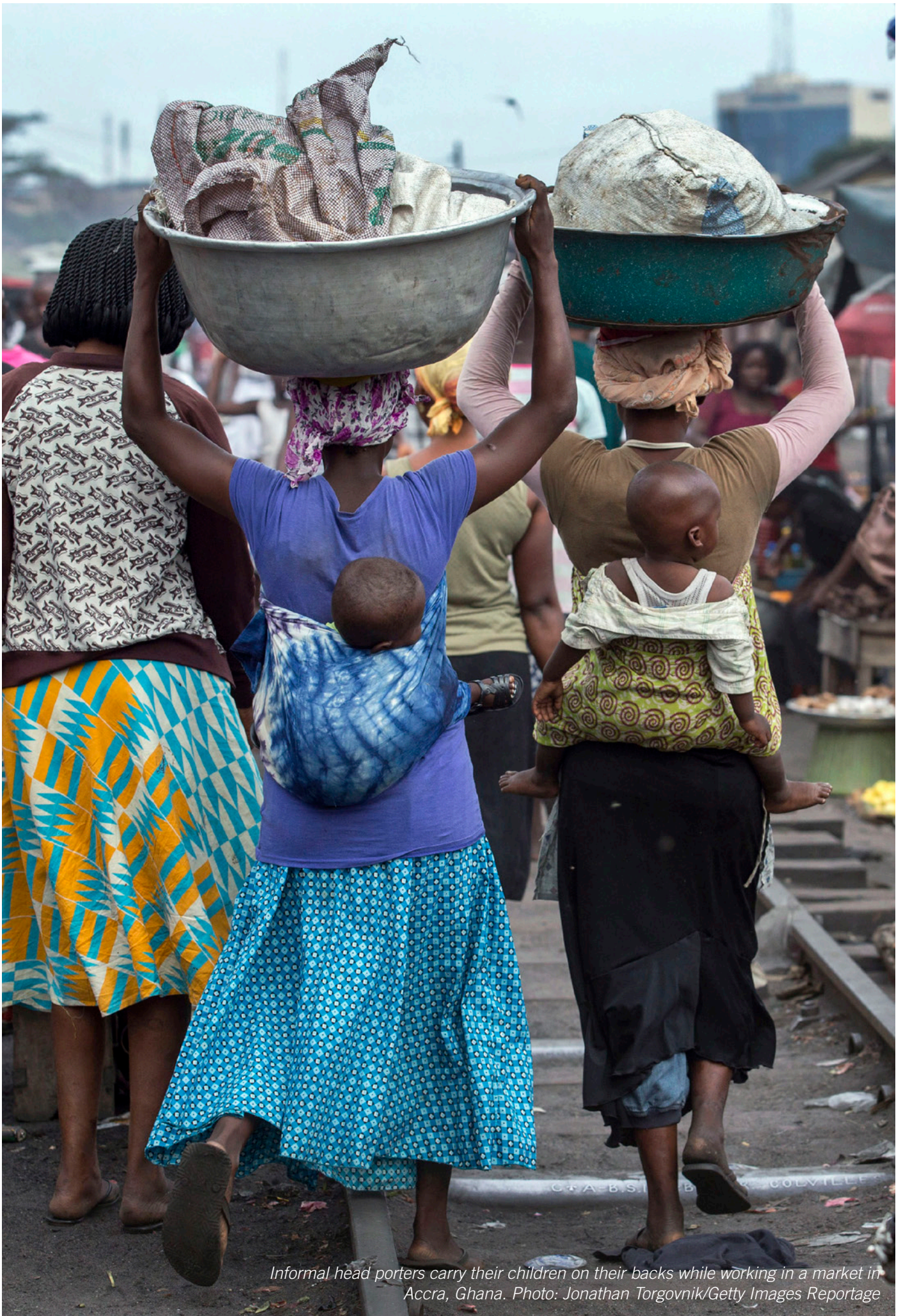
Informal head porters carry their children on their backs while working in a market in Accra, Ghana.