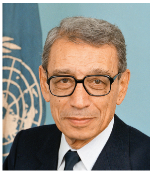
Boutros Boutros-Ghali (Egypt) January 1992 – December 1996