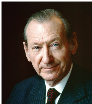
Kurt Waldheim (Austria) January 1972 – December 1981