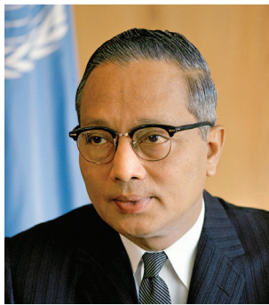
U Thant (Burma, now Myanmar) November 1961 – December 1971