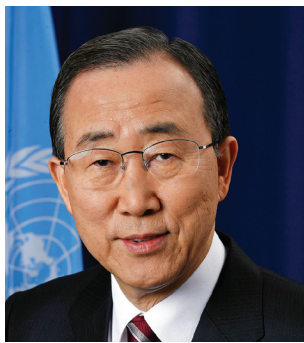
Ban Ki-moon (Republic of Korea) January 2007 – December 2016