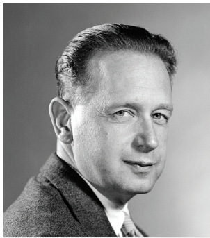
Dag Hammarskjöld (Sweden) April 1953 – September 1961