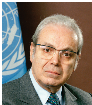
Javier Pérez de Cuéllar (Peru) January 1982 – December 1991