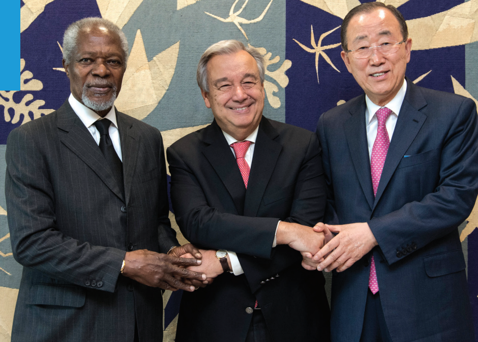
UN Secretary-General António Guterres (center) meets with former Secretaries-General Kofi Annan (left) and Ban Ki-moon (right)