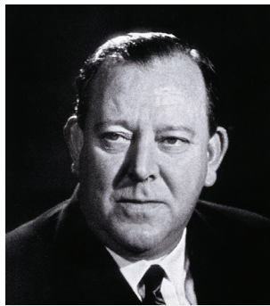
Trygve Lie (Norway) February 1946 – November 1952