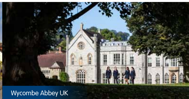
Wycombe Abbey UK