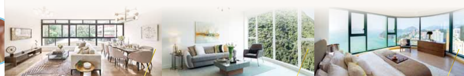
Old Peak Mansion

Discover a selection of quality properties in over 35 prime locations near the catchment areas of international schools with easy access to exceptional educational opportunities. Our residences offer unrivaled convenience and attentive services that go beyond to create the Signature of Luxury Living.