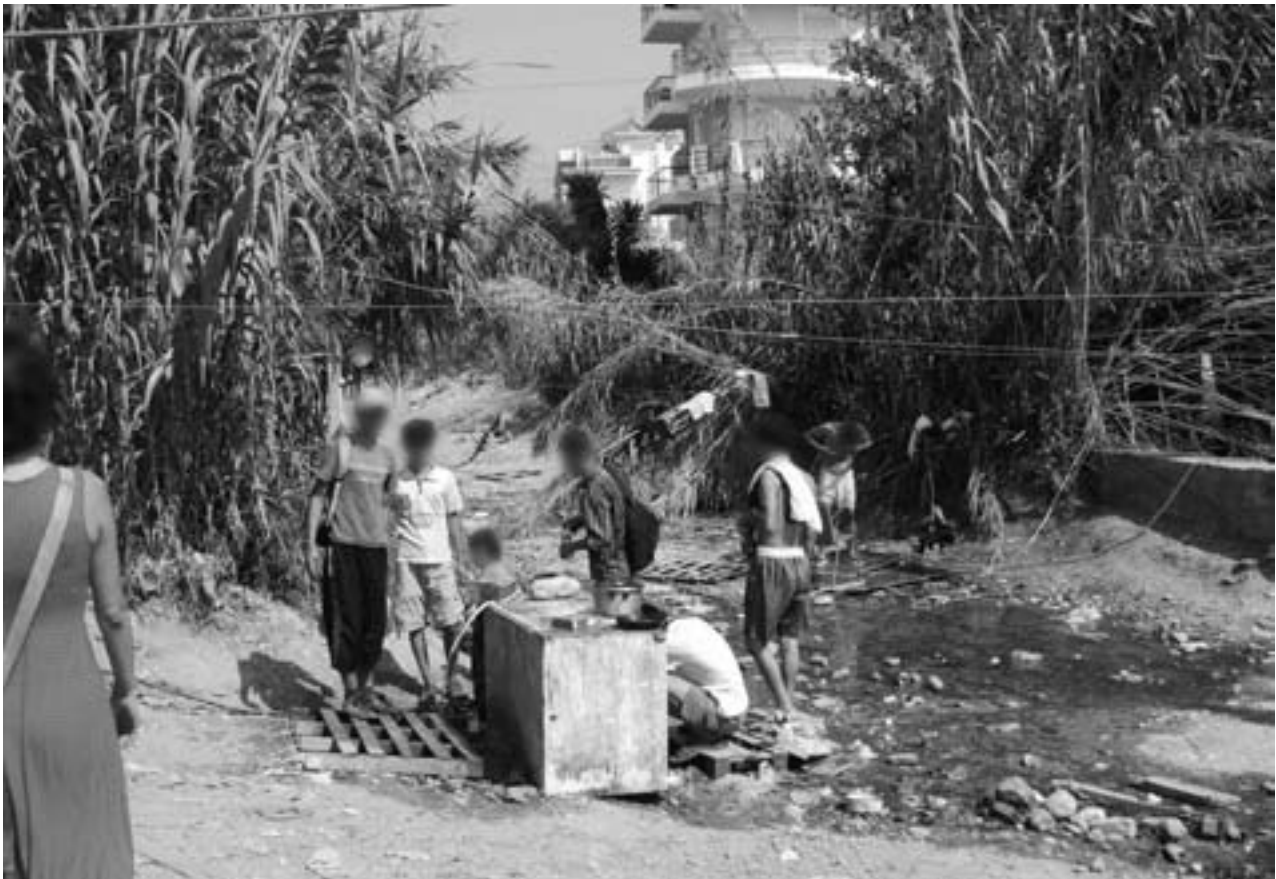
Patras: unsheltered refugees at a river, which serves as the only water supply

The people from the camp were trying to get into the off-limits port area. They wanted to reach Italy on one of the ferries. Sometimes they tried to get on board by clinging to lorries. Again, we heard of abuse by the Greek