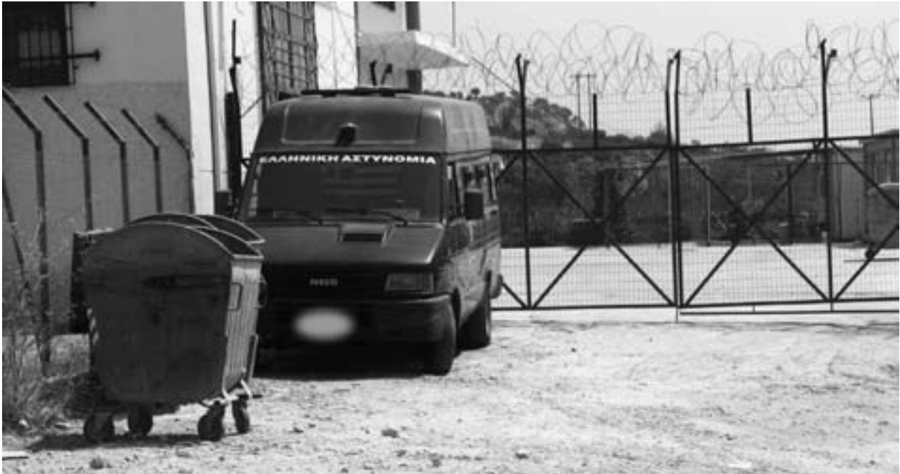
Lesbos: entrance to the detention centre