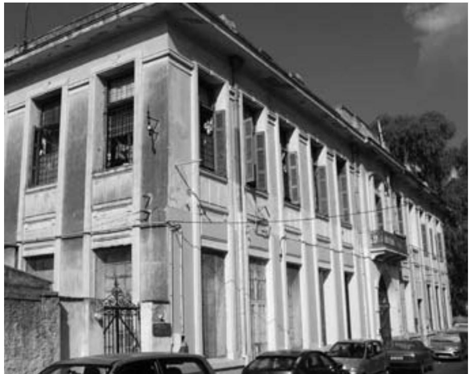
Detention centre Samos-City

The detention centre is in Samos City, in a former cigarette factory built in 1928. The building, which is in serious need of repairs, if not totally dilapidated, is in the middle of town.