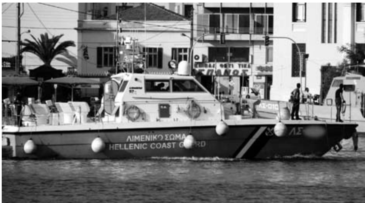
Boat of the Lesbos coast guard showing mount for a machinegun on its prow.

Even the head of the coast guard Mikromastoras confirms that, secretly, refugees are brought back to the Turkish coast, even after they have been on Greek