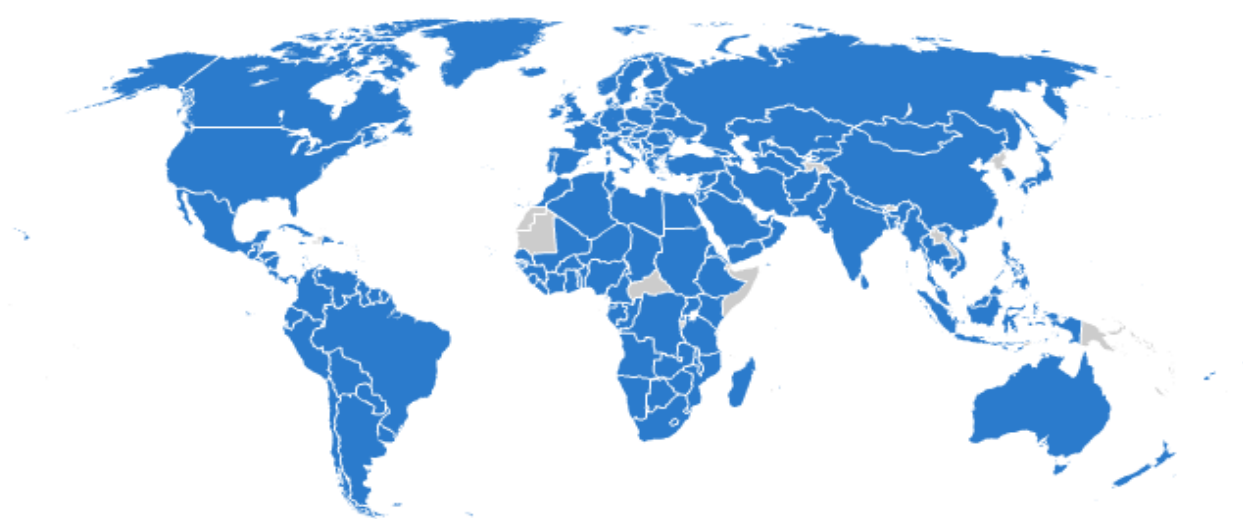
Figure 3. Nations Originating 5 or More SafetyLit Visitors per Month*

*Nations with fewer than 5 visitors per month are shown in gray.