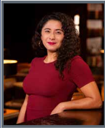
Harris County Judge Lina Hidalgo