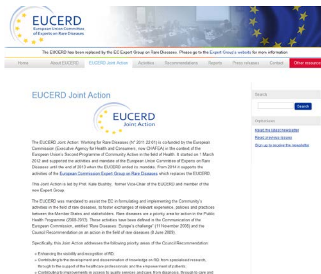
Figure 3: EUCERD Joint Action project area on www.eucerd.eu

The front page of the website was further overhauled in 2014 due to the end of the EUCERD's mandate. The site now serves as an archive of the EUCERD's activities, reports and recommendations, whilst the dedicated tab concerning EUCERD Joint Action activities remains updated to the end of the Joint Action. Visitors seeking information about the Commission Expert Group on Rare Diseases are redirected to the relevant part of the EC Public Health portal. The communications team has worked in collaboration with the EC website team to ensure that the State of the Art Reports and EUCERD recommendations have been transferred to the Expert Group's new website.