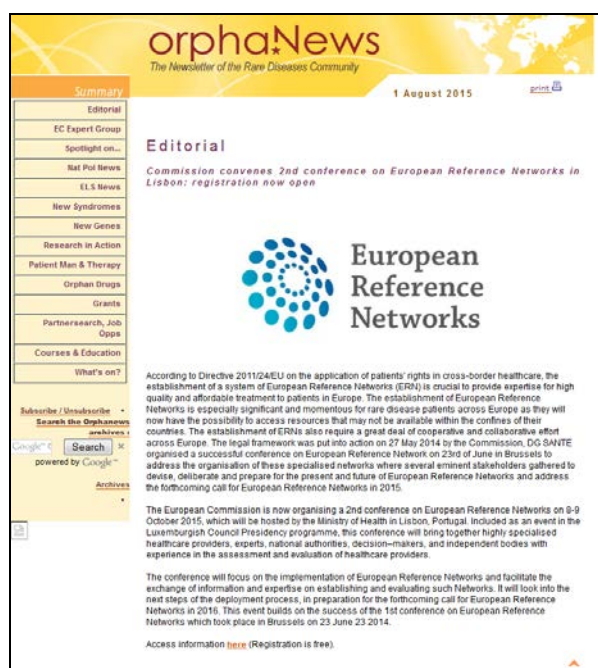
Figure 5: OrphaNews newsletter

OrphaNews covers both scientific and political news of interest to the rare disease community, including articles concerning the activities of the EUCERD/Expert Group and the EUCERD Joint Action, with spotlight articles on the outputs of the Joint Action already published/to come with the finalisation of the EJA activities following the final conference foreseen in September 2015. The different columns include: reports on the latest developments in the field of rare diseases and orphan drugs, including new syndromes, new genes, basic and clinical research, national and international policy, disease surveillance, clinical trial updates, orphan drug approvals, funding opportunities, ethical, social and legal issues, news from patient associations, upcoming events, and new publications.