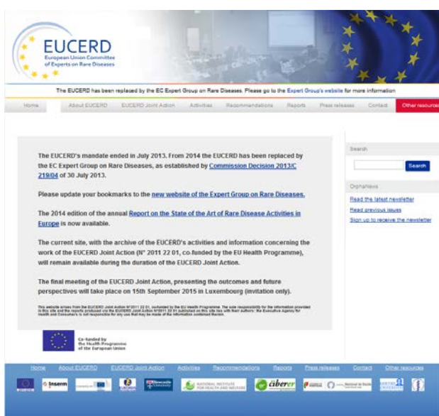
Figure 2: EUCERD website home page www.eucerd.eu