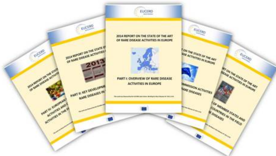
Figure 4: The five volumes of the 2014 edition of the State of the Art of RD Activities in Europe report

Since 2010, the publication of an annual report on the State of the Art of Rare Disease Activities in Europe has been supported by the EC, firstly via the RDTF/EUCERD Scientific Secretariat Joint Action (N° 2008 22 91), and from 2012 via the EUCERD Joint Action. This multi-volume report provides information concerning the state of the art of activities at both European and Member State levels, in particular the advances made to date in the implementation of the Council Recommendation on an Action in the field of rare diseases, notably the elaboration and implementation of national plans/strategies for rare diseases at national level. Elaborated with the input of stakeholders at national level and with the help of the members of the EUCERD/Expert Group on Rare Diseases, the report provides a transversal view of the rare disease field and its evolution over the past few years.