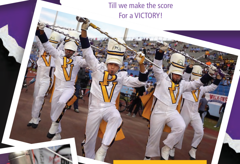
UNIVERSITY BAND THE MARCHING STORM