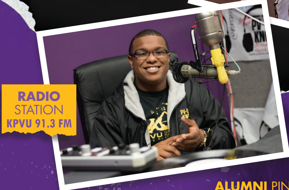
RADIO STATION KPVU 91.3 FM