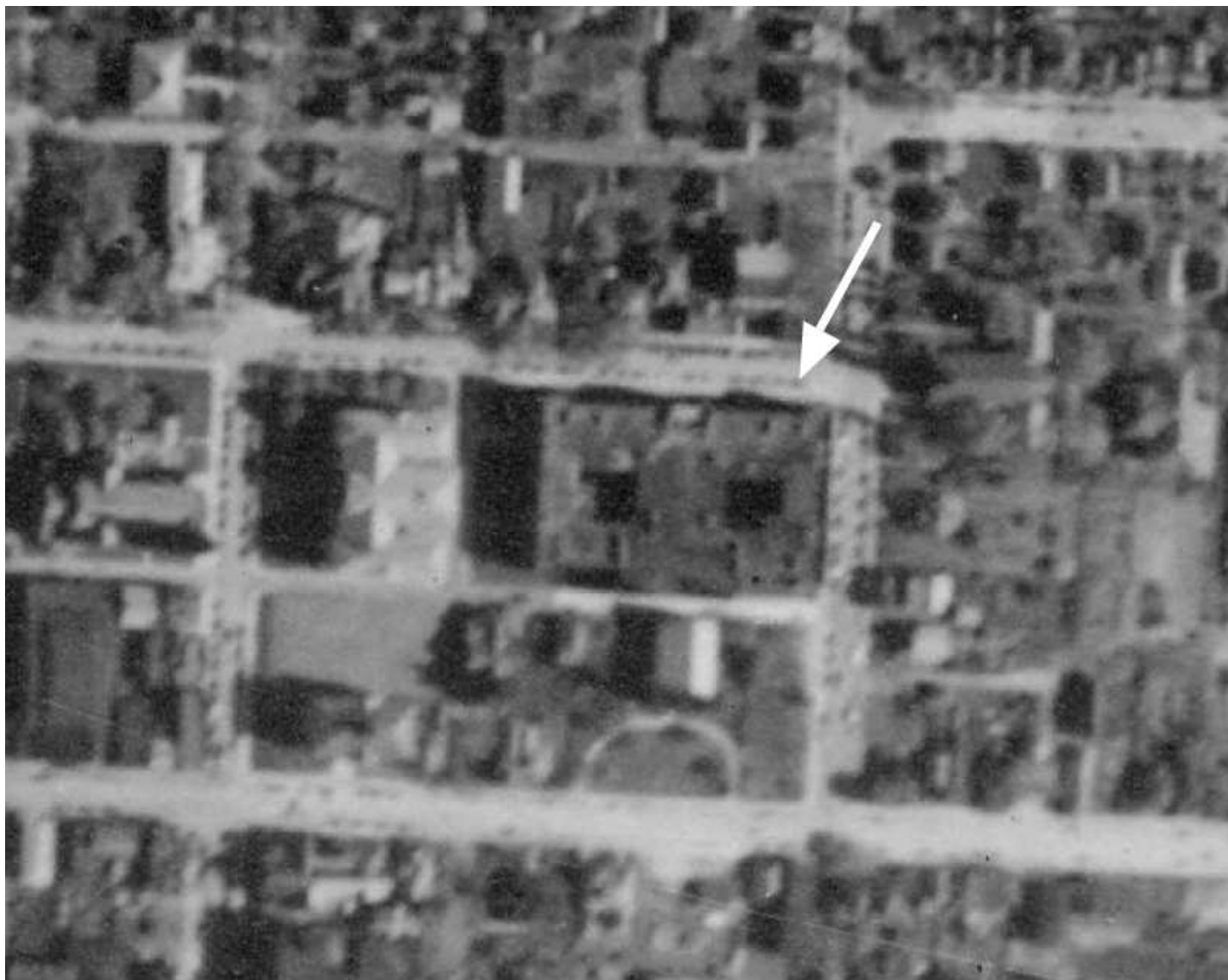
Aerial View of Butler Junior High

1993 Butler NE, PA Aerial Photograph. USGS Reference Number 440079-G8-02-PHT. Created on April 23, 1993.