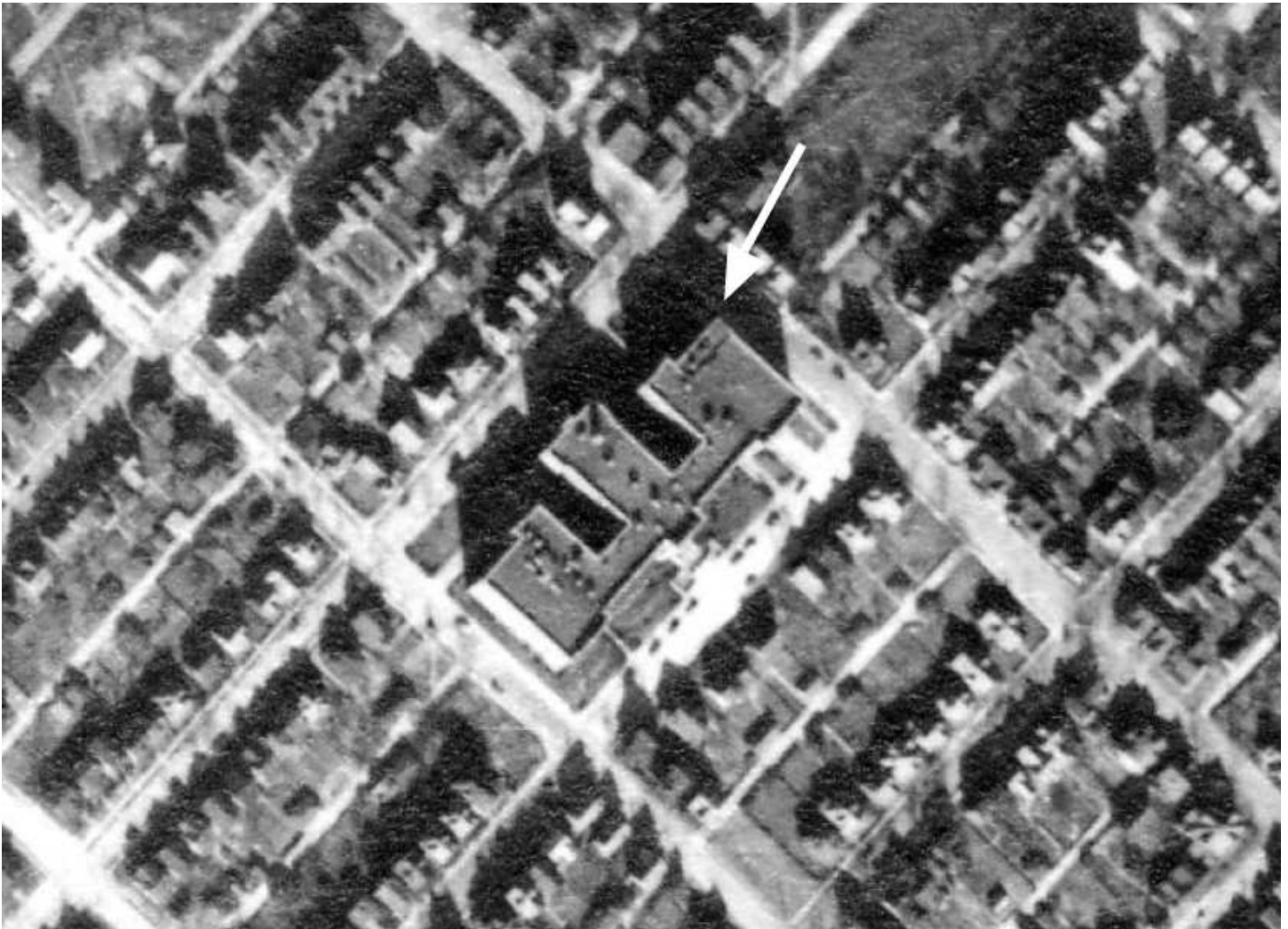
Aerial View of D. S. Keith Junior High

1998 Altoona, PA Quadrangle . 7.5 minute series. Topography compiled 1962. Planimetry derived from imagery taken 1988 and other sources. Photoinspected using imagery dated 1993. Survey control current as of 1963. Boundaries, other than corporate, revised 1998. Denver, CO.