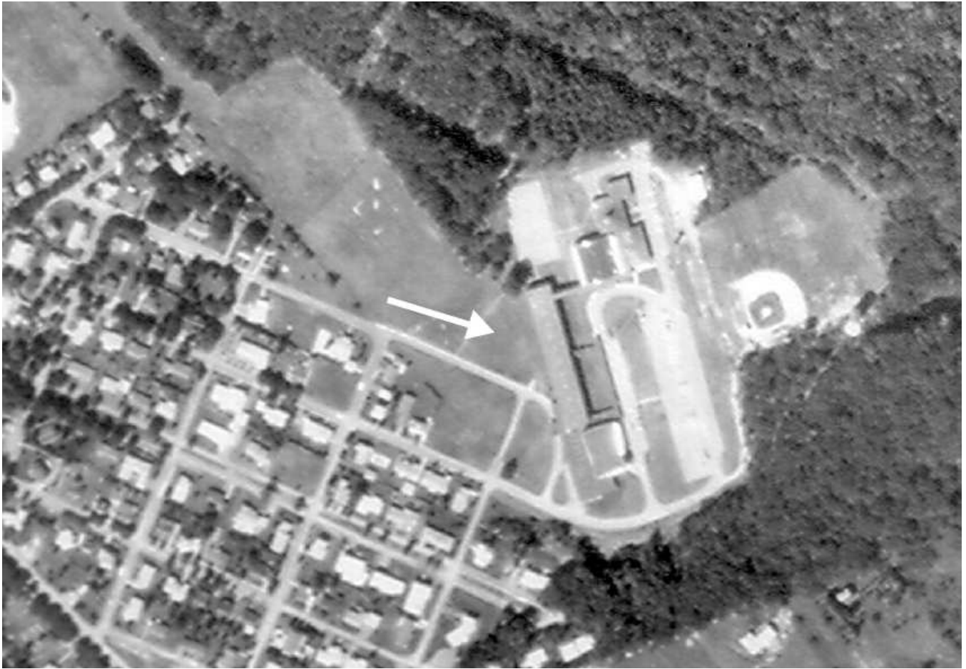
Aerial View of Philipsburg-Osceola Senior High