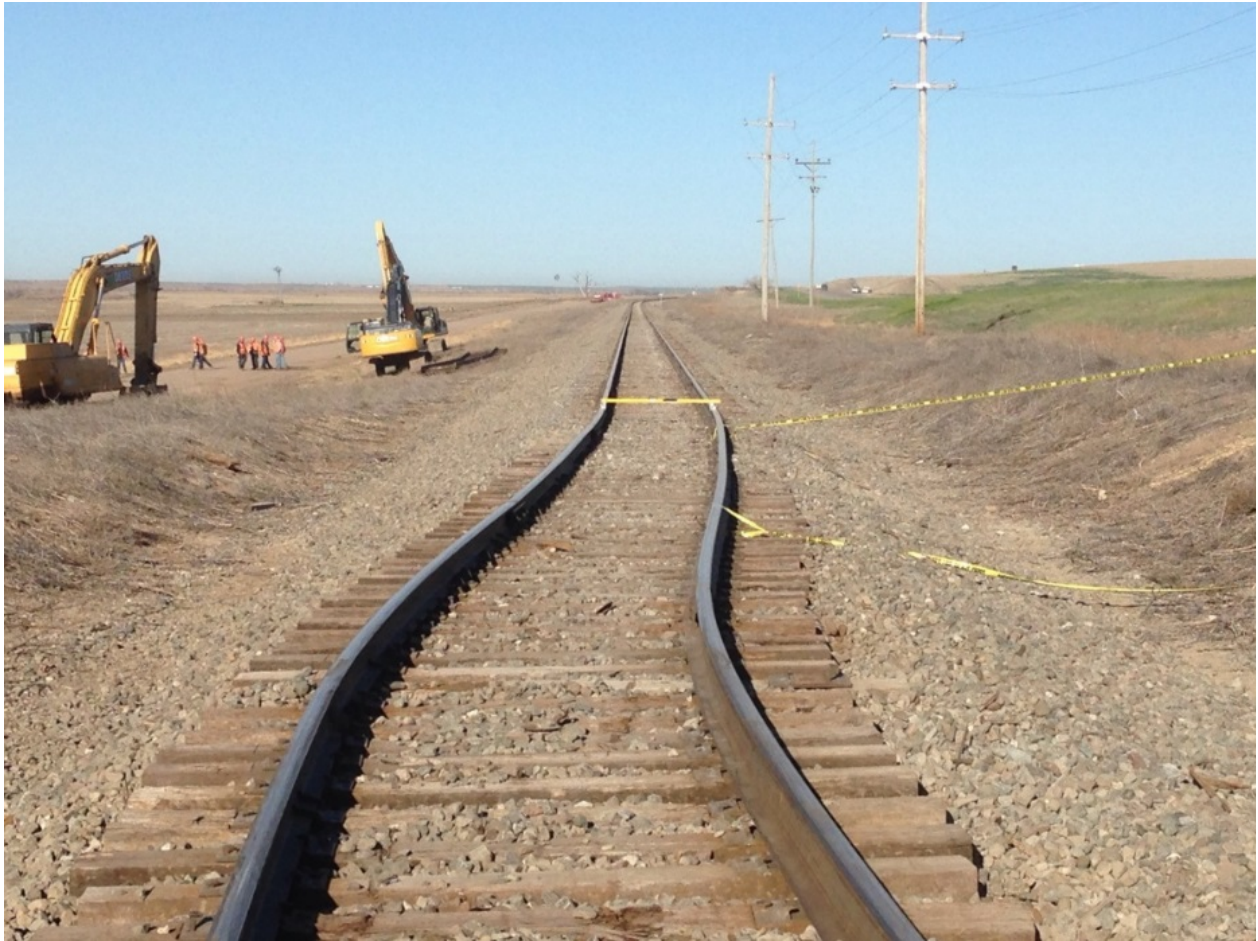
Figure 3. Looking west from the point of derailment at the misalignment (or lateral shift) of the track after the train moved over the shifted track.