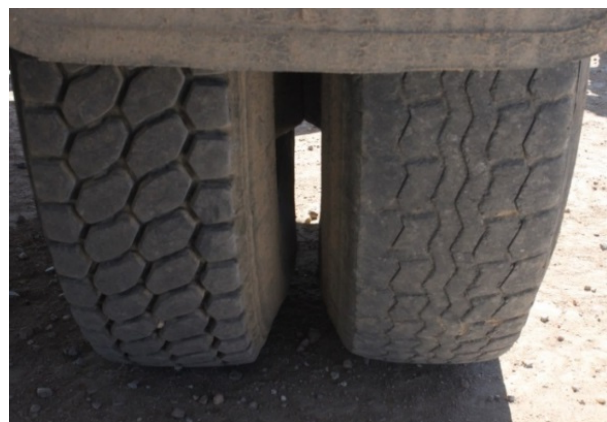
Figure 6. Tread pattern adjacent to MP 373.07; the right rear tires of the agricultural truck.