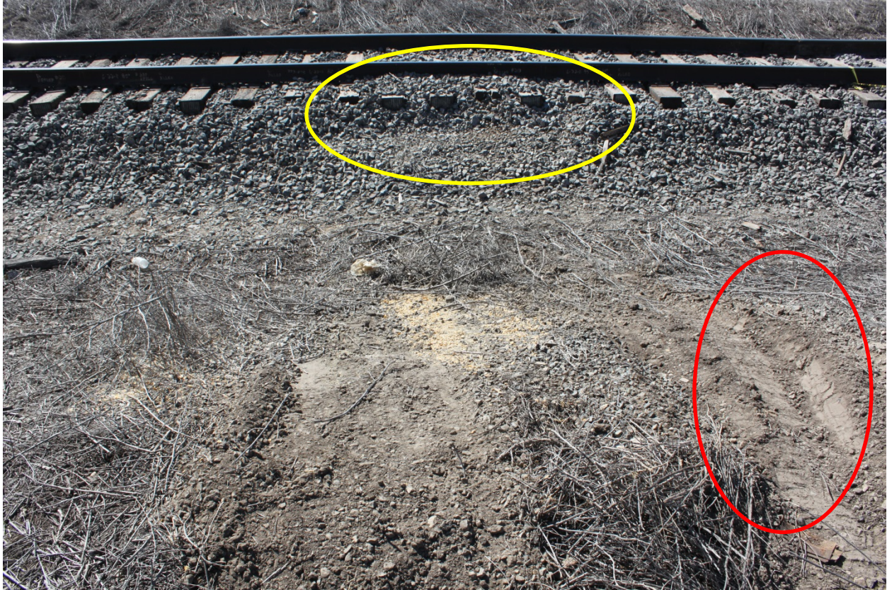
Figure 4. A red circle marks the impression from the truck's tire in the rock at the side of the tracks. The yellow circle marks the spot where the truck hit the railroad tracks.

At the scene, investigators found recent damage to the north ends of the ties at MP 373.07, recent tire marks perpendicular to the point of impact, and some cattle feed on the ground. (See figure 4.)