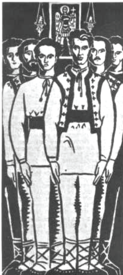
The Văcăreșteni, the charismatic staff of the Legion, around the venerated icon of Saint Michael.

Since, during the time, the circle of charismatic aristocracy—composed initially of the Văcăreșteni —considerably enlarged, in 1933, Codreanu established the rank of “Legionary commander,” awarded to prominent legionaries such as Ion I. Moța, Ion Banea and Mihai Stelescu. In 1936, the Captain created the “Knights of the Annunciation,” a corpus of commanders selected on basis of their combat merit, trust and loyalty, and kept in high esteem among Legionaries.