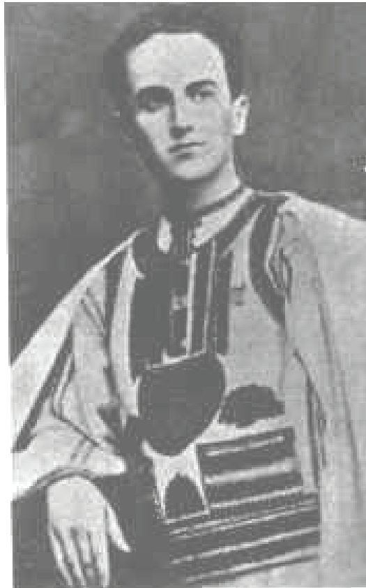
Ion I. Moța (1902-1938), a “Byronic leader,” 243 dressed in folk costume.

In his writings, Moța expressed all the steps of this messianic scenario with Codreanu as protagonist as follows: