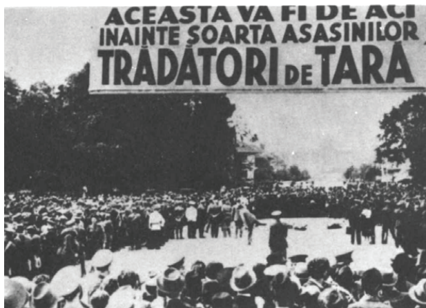
The summary execution of the Legionary death squad, in the same square where they assassinated Prime Minister Armand Călinescu.

The picture occasions a comment on the nature of political violence in the Balkans. In view of irredenta wars and forced population movements that accompanied the formation of nation-states, the area has been generally regarded as a classic locus of violence. Most recently, numerous scholars have reacted against the “essentialization” of the historical experience of the Balkans, pointing out that violence is a universal practice, no region possessing a monopoly on it. In his short history of the Balkans, Mark Mazower argues that the association of the Balkans with violence is in fact due to a change in the concept and meaning of “acceptable violence” in the West. 409 If in the Middle Ages executions used to take place in the public square, beginning with the second half of the nineteenth century,