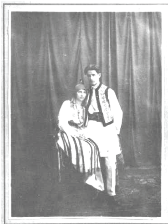
Wedding photograph of Corneliu Zelea Codreanu and Elena Ilinoiu, at Crâng, near Focșani, 13 June 1925. The ceremony was filmed, but the police destroyed all copies, on the ground that the movie was a sensitive propaganda material.

The process of nationalizing the state in Greater Romania thus generated as a side effect the confrontation between the hegemonic official culture and the radicalized student counterculture. The main promoter of this counterculture was the nucleus of the Văcăreșteni, which had been formed by plans of criminal plots, the common experience of prison, and assassinations. Its main founders, Corneliu Zelea Codreanu and Ion I. Moța, spelled out students' frustrations and put forward a mystical sublimation of their experience.