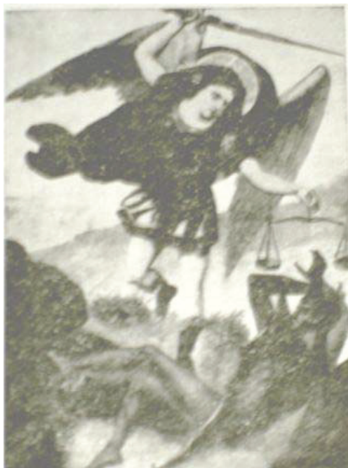
The icon of Saint Michael from the Văcărești monastery, which allegedly inspired Codreanu's charismatic "revelation." Saint Michael is depicted holding the sword in one hand and the scale of justice in the other.

The cult of the punitive figure of Saint Michael thus became the main source of the Legion's doctrine and the object of a fanatic Legionary cult: Michael's observance on 8 November was proclaimed the official celebration of the movement. Legionaries adopted an apocalyptic, Manichean vision of the world, portraying themselves as an earthly Christian army, as knights of the light in perpetual fight with the devil, a feature that accounts for the inherent violent and revengeful character of the movement. A quotation from the Bible eloquently speaks for the militant character of Saint Michael: