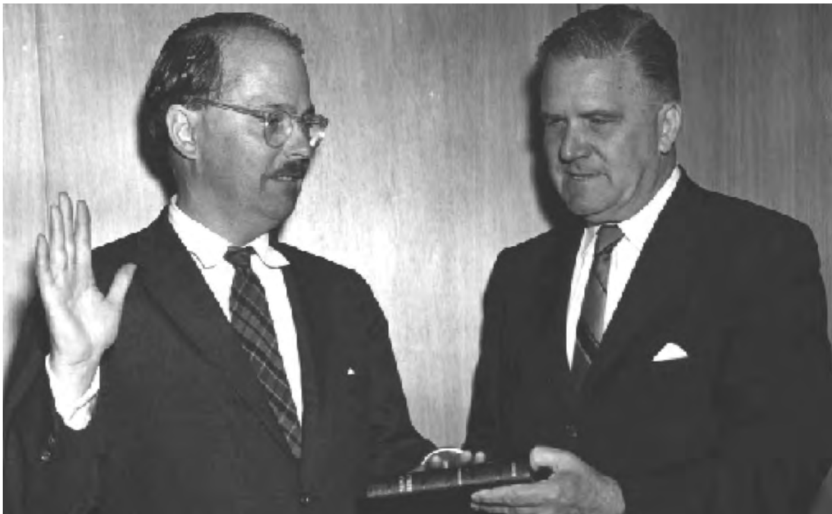
Willis Shapley had been a member of the Bureau of the Budget during 1957–1958, where he eventually became director for space program coordination. In 1965, he moved to NASA as associate deputy administrator, with his duties including supervision of the public affairs, congressional affairs, interagency affairs, and international affairs offices. He is shown here being sworn in to his NASA position by Administrator James E. Webb.

Shapley: Well, I and my colleagues were a part of the Executive Office of the President and so setting policy direction and deciding political reactions were really beyond our scope. Of course, we all had personal ideas of one sort or another but as the Administration position, as the record shows, changed gradually over the period that we're talking