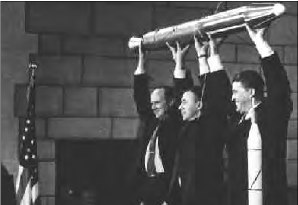
Dr. William H. Pickering, director of the Jet Propulsion Laboratory; astrophysicist Dr. James A. Van Allen, University of Iowa; and Dr. Wernher von Braun, director of the Army's Redstone launch vehicle program, announced on February 1, 1958, at the National Academy of Sciences that they had successfully launched the first U.S. satellite, Explorer 1. This was the signature image that appeared in newspapers around the nation the next morning, but this success also served notice that the nation had to codify the authority for space exploration in a single organization.