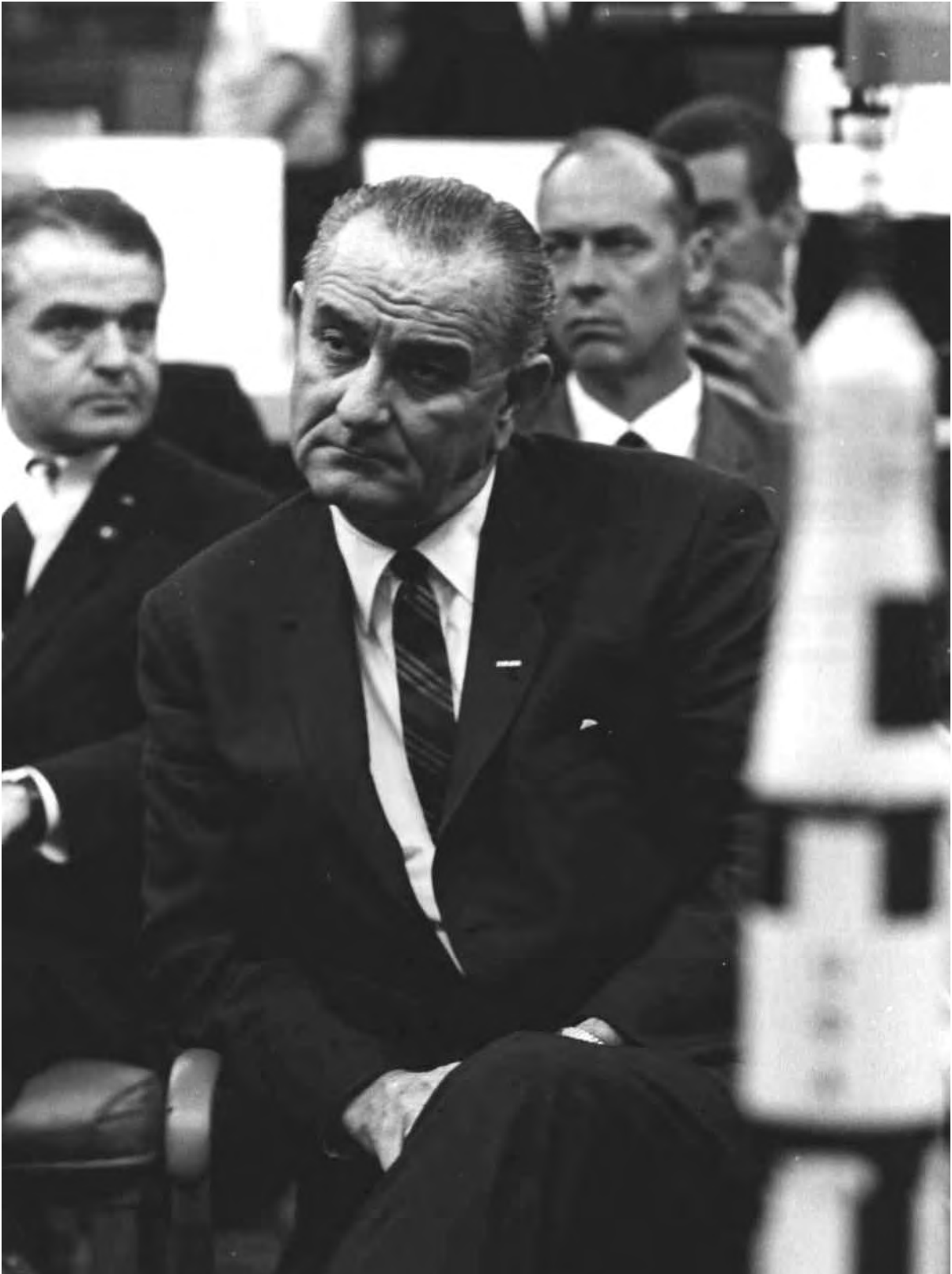
No one understood the importance of the launch of Sputnik for the psyche of the American people more effectively than Senate Majority Leader Lyndon B. Johnson. Here he is shown as president on September 15, 1964, at a meeting hosted by NASA, the agency that he helped to create with the National Aeronautics and Space Act of 1958.