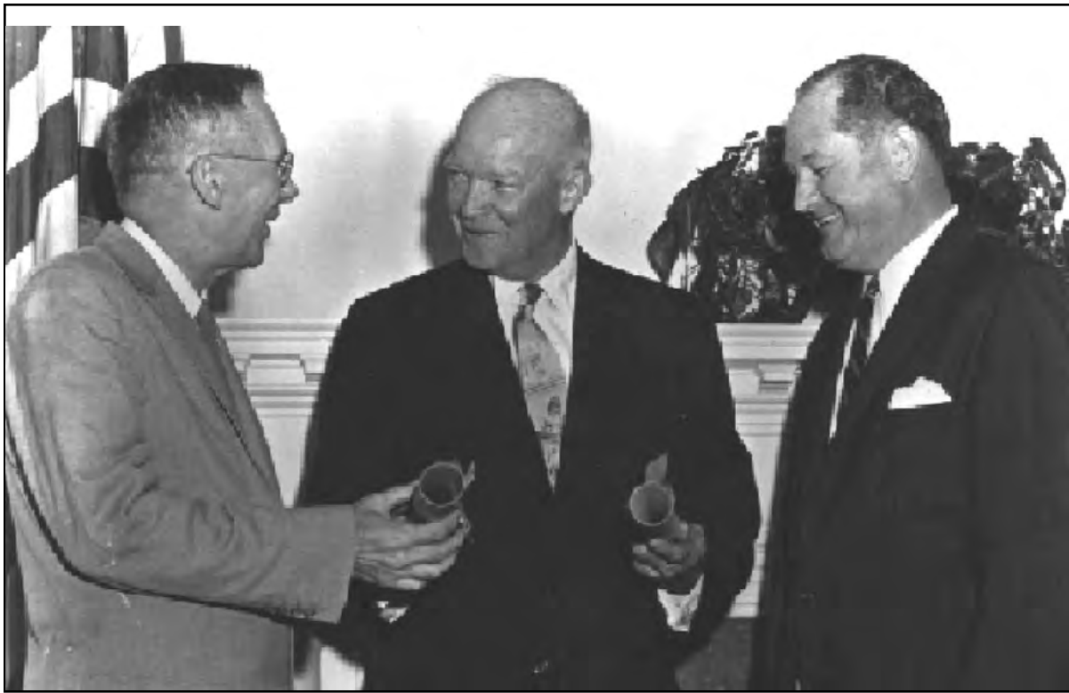
With the passage of the National Aeronautics and Space Act of 1958, and NASA's establishment on October 1, 1958, President Eisenhower appointed T. Keith Glennan (right) as administrator and Hugh L. Dryden (left) as deputy administrator.

ninety minutes or less they just automatically went over national boundary lines. They couldn't do anything about that.