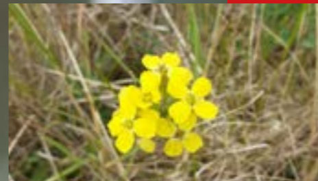
Isle of Man cabbage RED