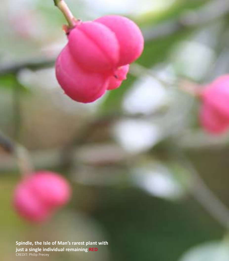
Spindle, the Isle of Man's rarest plant with just a single individual remaining RED CREDIT: Philip Precey