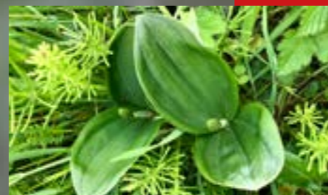
Common twayblade AMBER