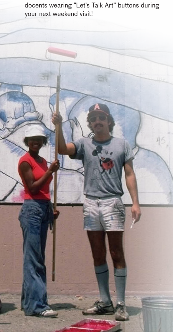
Judy Baca and kids with paint rollers

Curious about how spices connect past and present diasporic communities in Southern California and the United States? Writer and culinary historian Michael Twitty will lead a cooking demonstration and hands-on spice blend workshop that explores these ties and how they both preserve and expand regional voices.