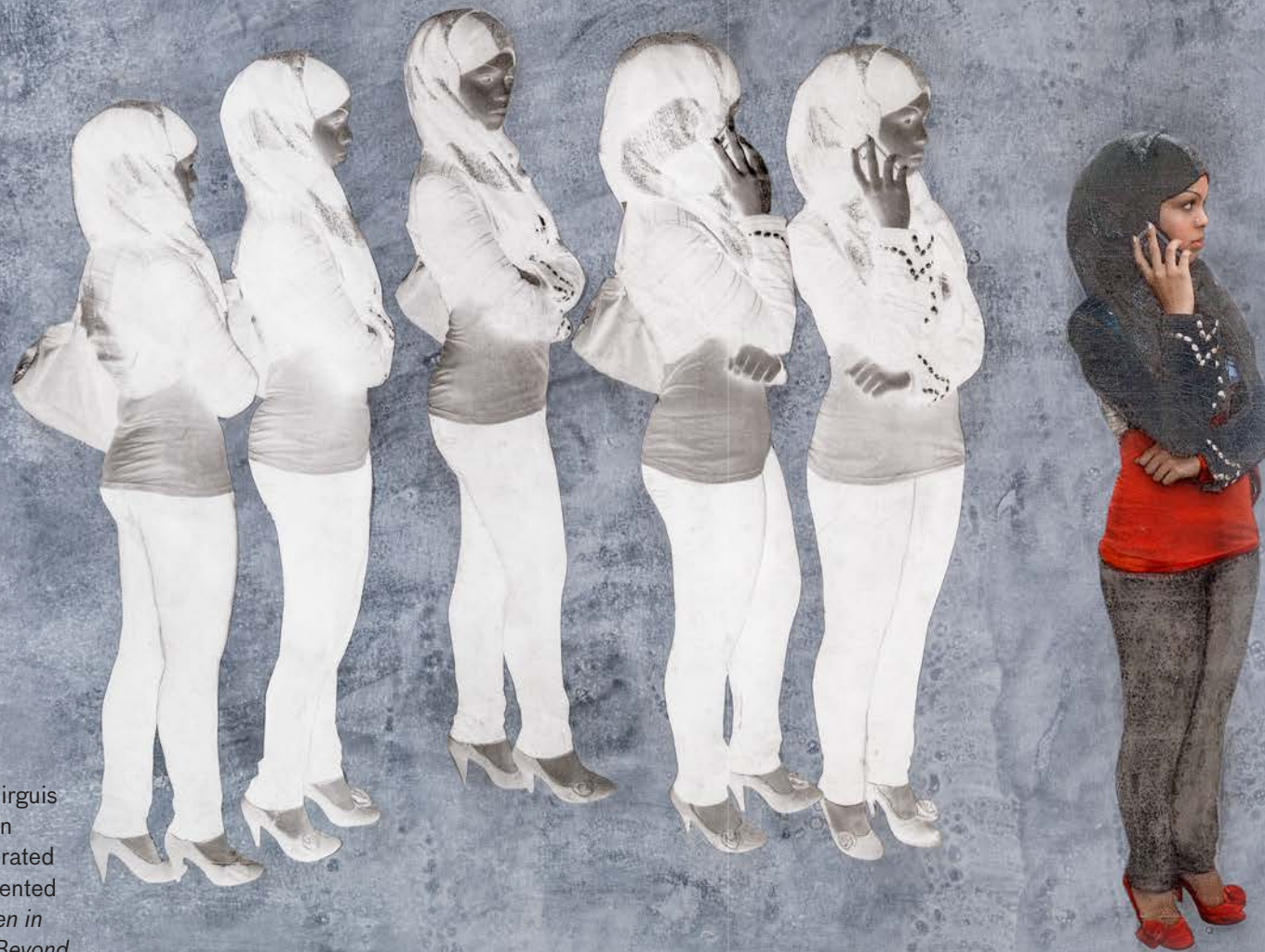
Image Credit: Huda Lutfi, Red Shoes , 2010, Los Angeles County Museum of Art, Purchased with funds provided by Art of the Middle East: CONTEMPORARY, © Huda Lutfi, photo © Museum Associates/LACMA