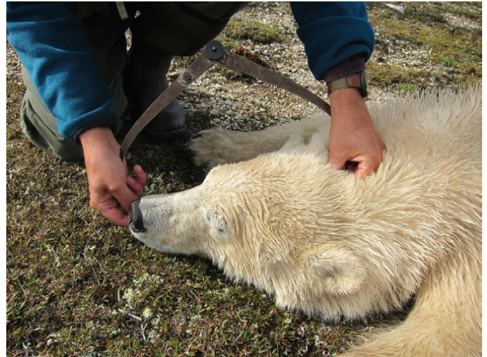
Measuring head length of Polar Bear