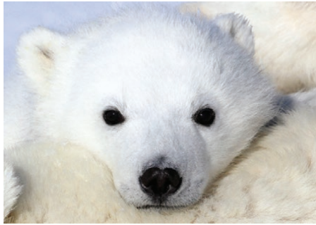
Cub-of-the-year in spring