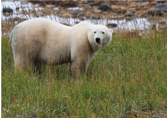
Polar Bear ( Ursus maritimus ) onshore waiting for ice to reform

Result description: The PBSG completed the essential habitat assessment and submitted a report and maps to the Polar Bear Range States. The PBSG reviewed and commented on the draft sustainable harvest document. The PBSG is an ongoing contributor to the climate change communications working group.