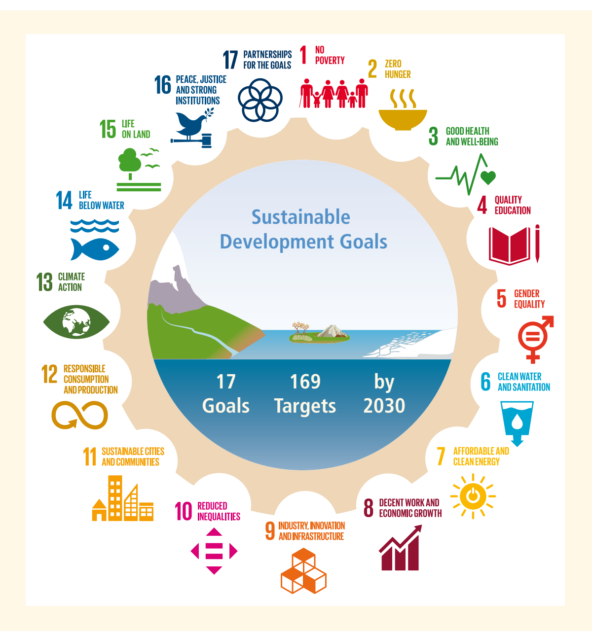
FAQ 1.2, Figure 1 | The United Nations 2030 Sustainable Development Goals (SDGs).

Without transformative adaptation and mitigation, climate change could undermine progress towards achieving the 2030 SDGs, and make it more difficult to implement CRDPs in the longer term. Reducing global warming (mitigation) provides the best possibility to limit the speed and extent of ocean and cryosphere change and give more options for effective adaptation and sustainable development. Progress on SDG 4 (Quality Education), SDG 5 (Gender Equality) and SDG 10 (Reduced Inequalities) can moderate the vulnerabilities that shape people's risk to ocean and cryosphere change, while SDG 12 (Responsible Consumption and Production), SDG 16 (Peace, Justice and Institutions) and SDG 17 (Partnerships for the Goals) will help to facilitate the scales of adaptation and mitigation responses required to achieve sustainable development. Investment in social and physical infrastructure that supports adaptation to inevitable ocean and cryosphere changes will enable people to participate in initiatives to achieve the SDGs. Current and past IPCC efforts have focused on identifying CRDPs. Such adaptation and mitigation strategies, supported by adequate investments, and understanding the potential for SDG initiatives to increase the exposure or vulnerability of the activities to climate change hazards, could also constitute pathways for progress on the SDGs.