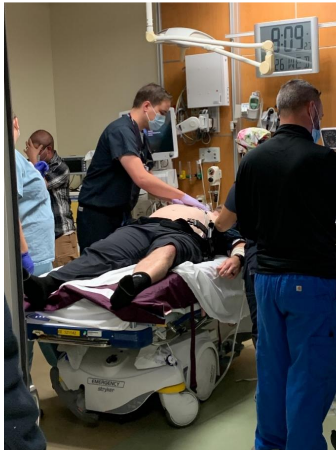
(Emergency department staff assessing trauma wound, documenting clinical findings, and entering treatment orders during simulation training.)