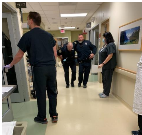
Two VA police officers enter the ED during simulation training. Officer on left has gunshot wound in the back. Medical provider and RN awaiting their arrival.

GSWs pose an increasing threat in society, necessitating preparedness even in non-trauma center facilities such as the MVAHCS. To ensure prompt and effective medical stabilization, the MVAHCS conducted an interprofessional GSW simulation in its emergency department (ED), involving VA federal police, blood bank personnel, physicians, anesthesia providers and nursing staff. This comprehensive simulation, led by dedicated simulation staff and medical students, aimed to test system protocols, evaluate clinical response readiness, and support quality improvement efforts.