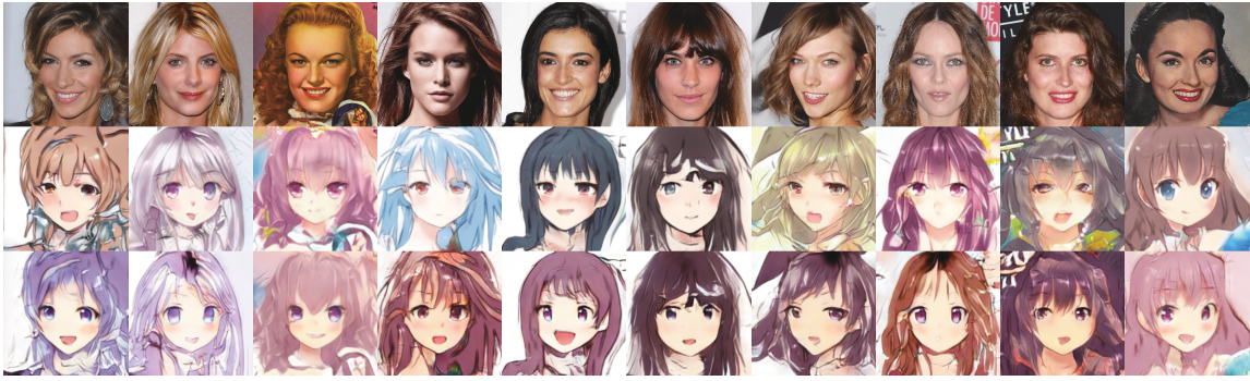
Figure 2: Stylization results on face2anime dataset. Top: source image. Middle: styles generated by baseline UGATIT model with 57.1 GMACs. Bottom: our searched model under 5.56 GMACs.