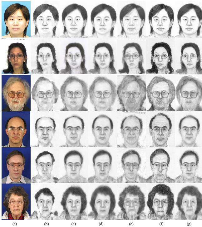
Figure 2: Comparison between the proposed method and the conventional methods for synthesizing sketches on CUFS. (a) Input photos. (b)-(g) Results of MRF-based, MWF-based, Bayesian-based, FCN-based, GAN-based and MRNF-based methods, respectively.

proposed method with the MRF-based method [Wang and Tang, 2009], the MWF-based method [Zhou et al. , 2012], the Bayesian-based method [Wang et al. , 2017], the FCN-based method [Zhang et al. , 2017], and the GAN-based method [Goodfellow et al. , 2014].