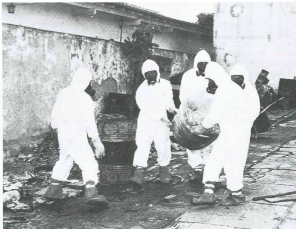
Contaminated items being removed.

matological and medical examinations, good nursing care and bioassay of blood cultures contributed to the early detection and therapy of local systemic infections.