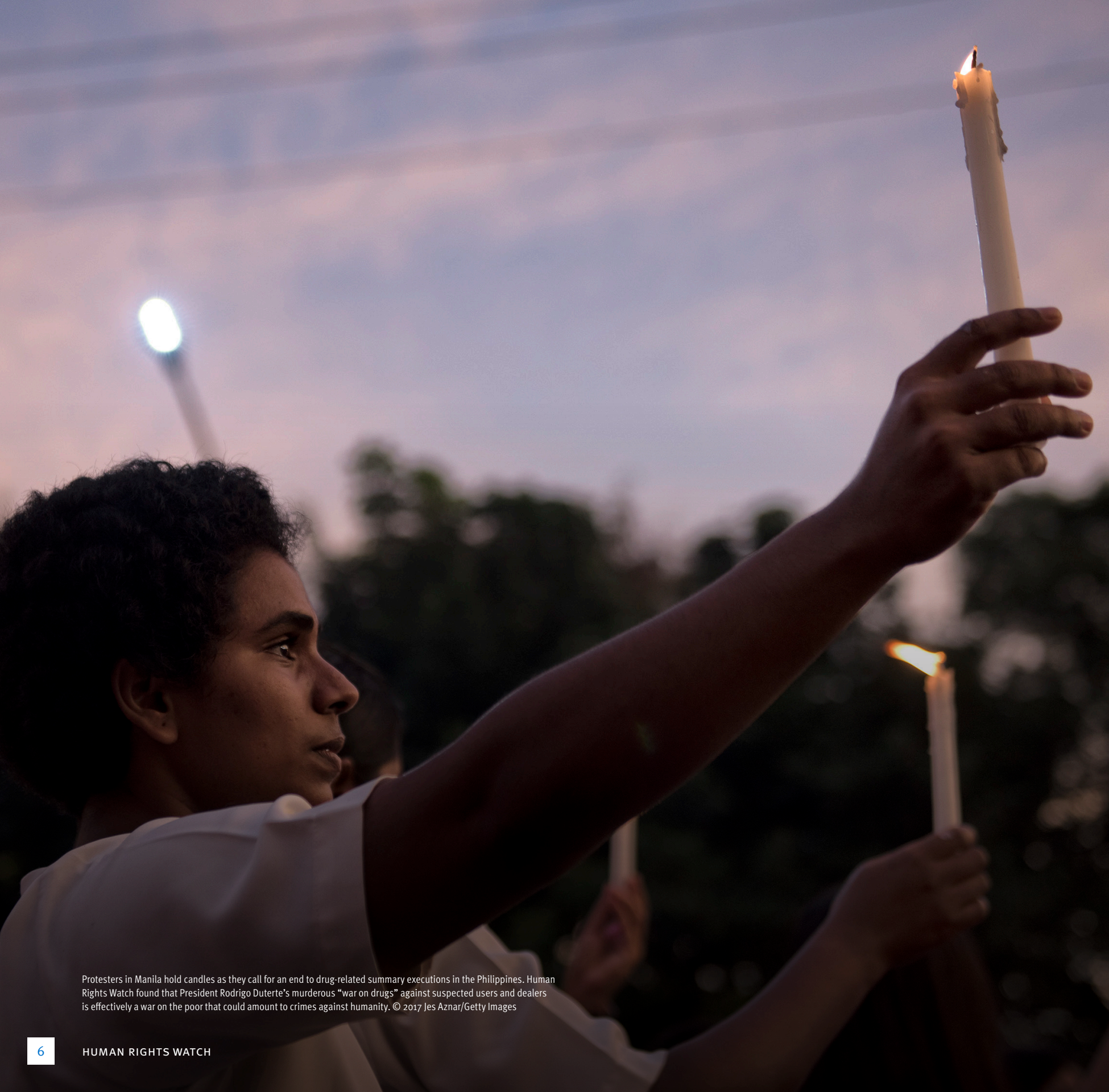
Protesters in Manila hold candles as they call for an end to drug-related summary executions in the Philippines. Human Rights Watch found that President Rodrigo Duterte's murderous "war on drugs" against suspected users and dealers is effectively a war on the poor that could amount to crimes against humanity.