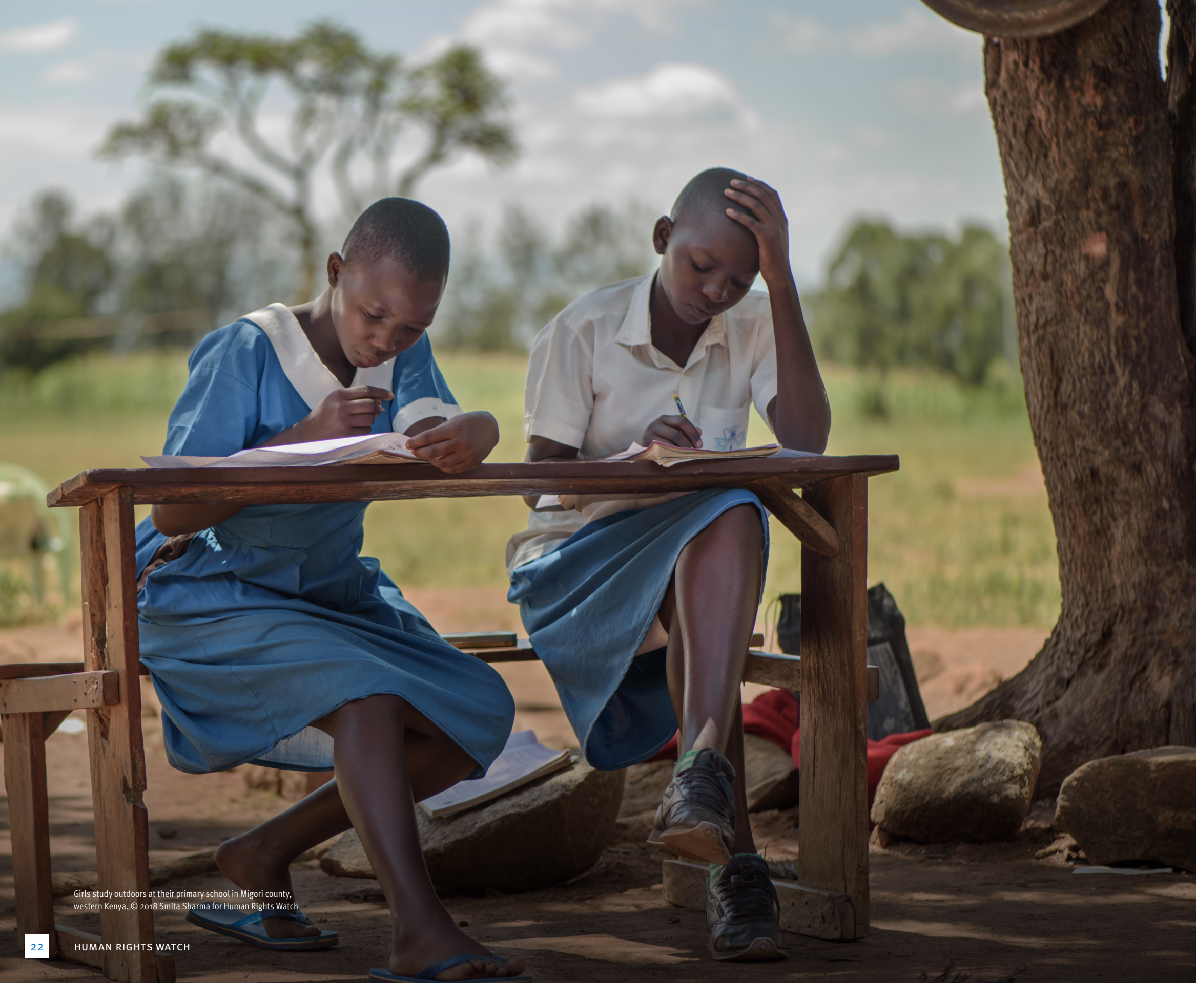
Girls study outdoors at their primary school in Migori county, western Kenya.