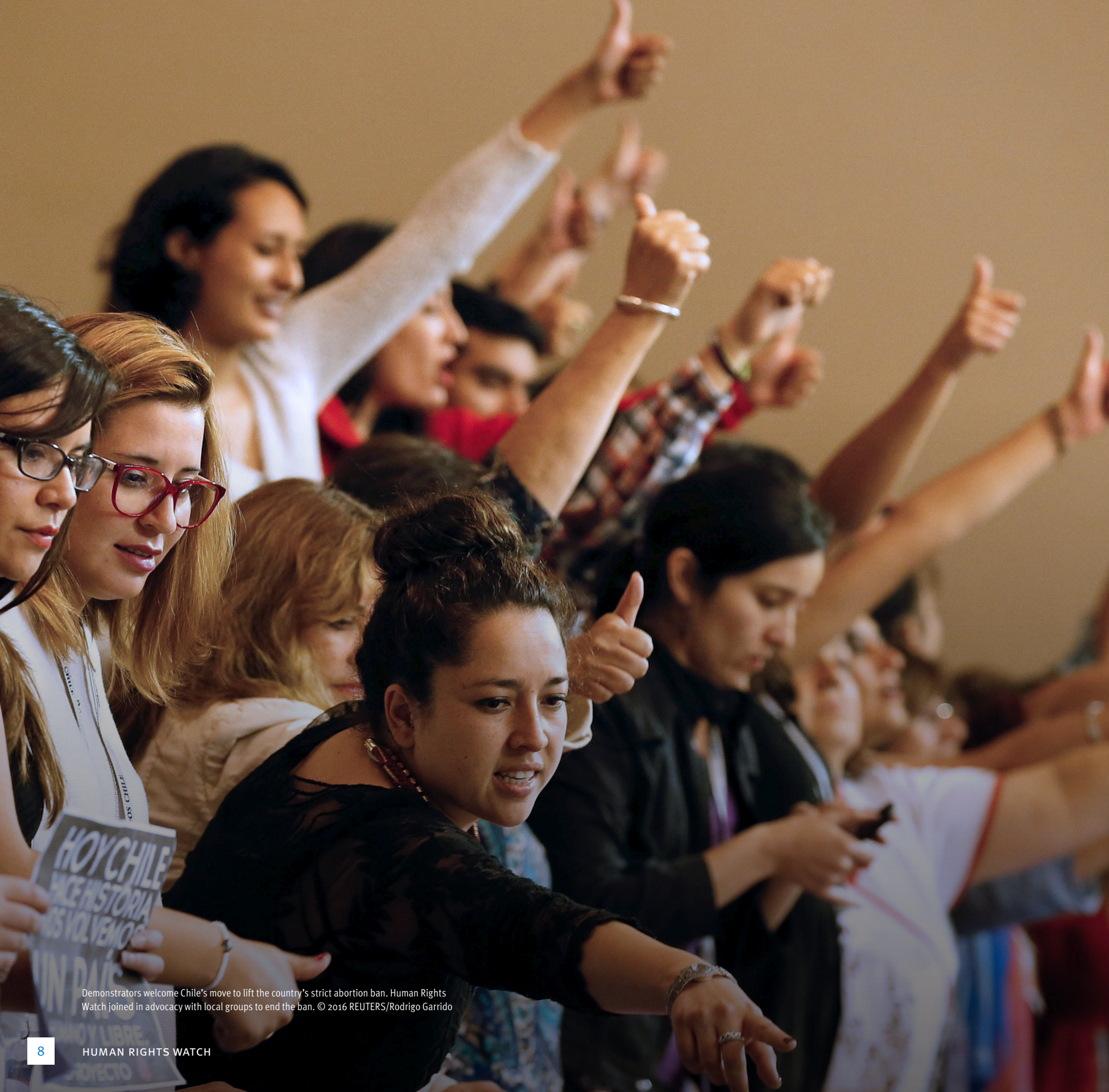
Demonstrators welcome Chile's move to lift the country's strict abortion ban. Human Rights Watch joined in advocacy with local groups to end the ban.