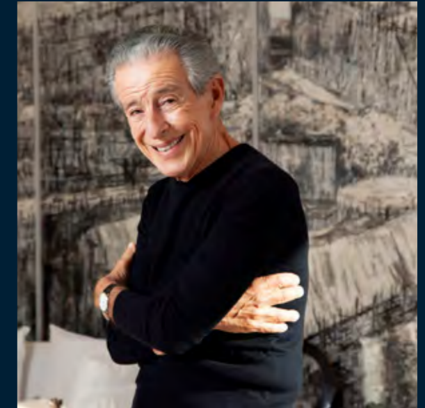
Jean-Louis Servan-Schreiber (1937-2020)