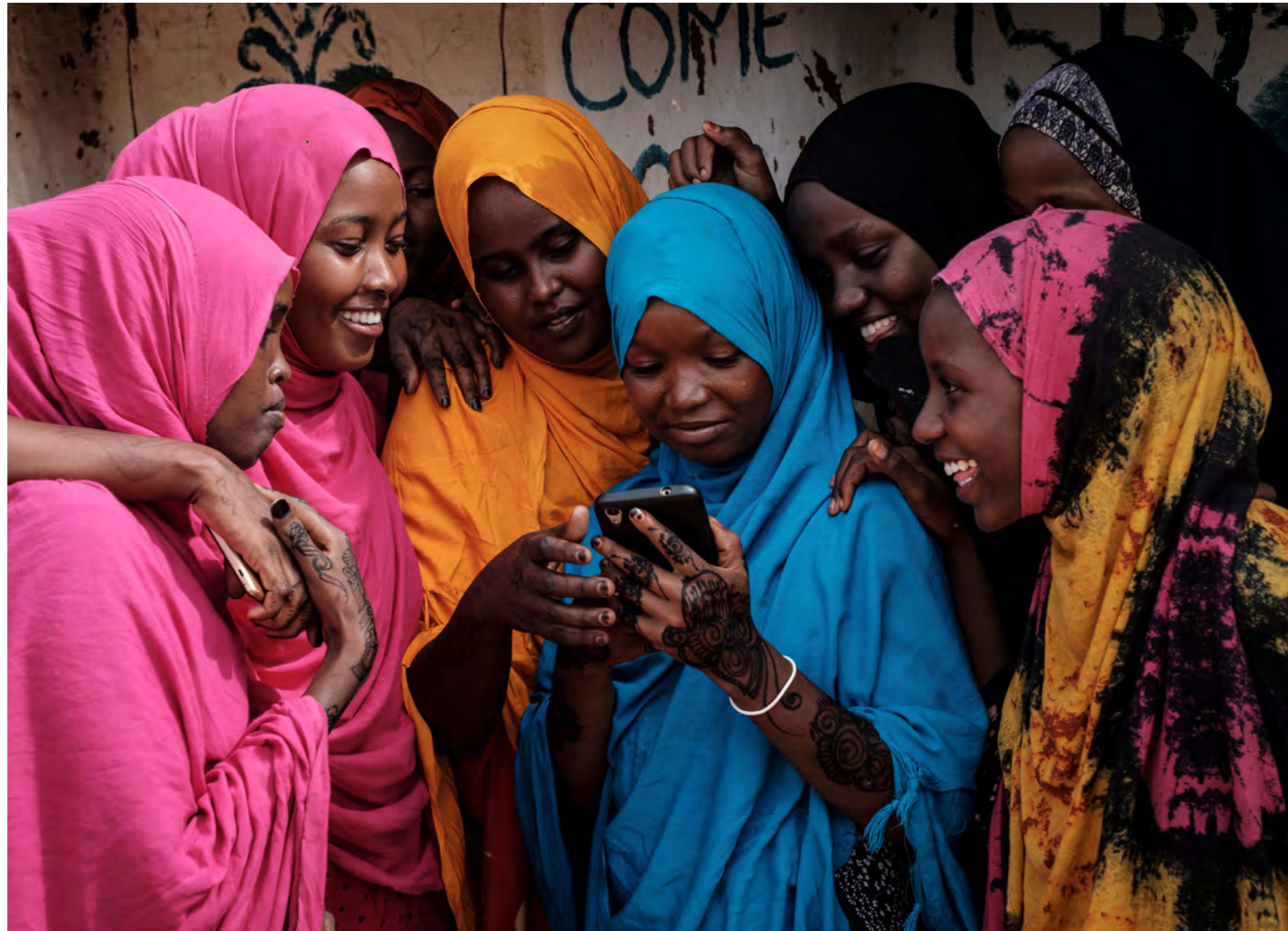
Young Somali women consult a smartphone at the Dadaab refugee complex in Kenya.