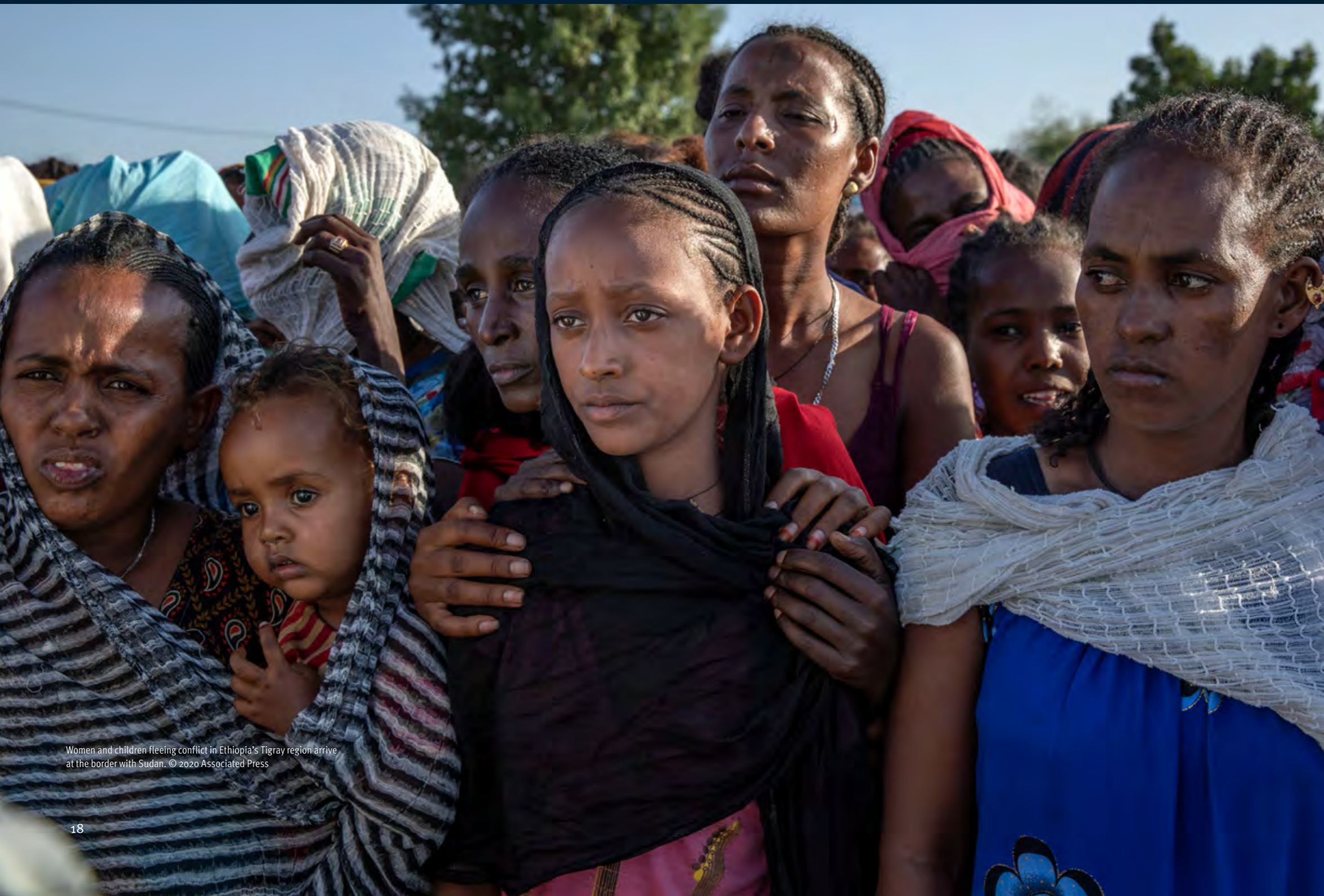
Women and children fleeing conflict in Ethiopia's Tigray region arrive at the border with Sudan.

These tactics are never 100 percent effective. But through careful fact-finding and strategic advocacy, a small group of people can raise the cost of repression and ameliorate suffering around the globe.