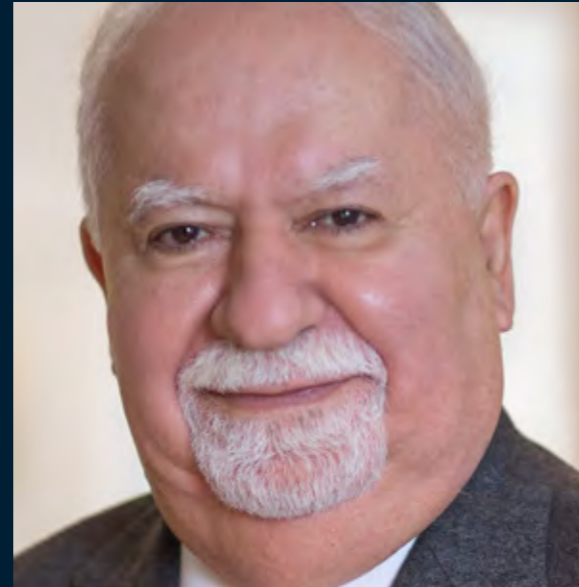
Vartan Gregorian (1934-2021)