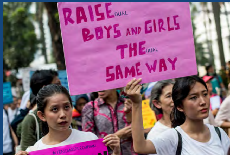
Left: People demonstrate for equal rights and an end to violence against women in Jakarta, Indonesia.