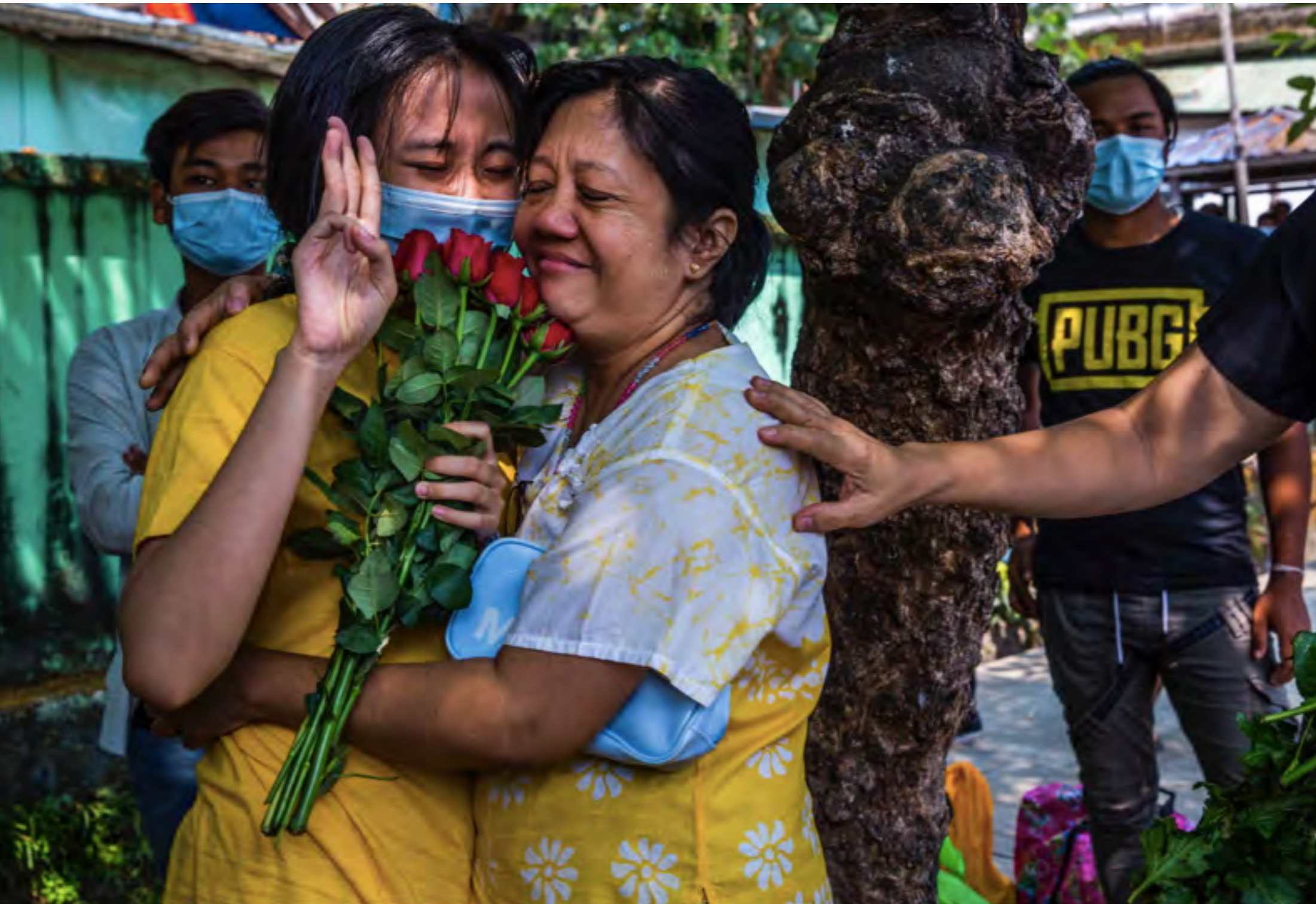
A protester released from prison after three weeks of detention makes a three-finger (pro-democracy) sign as she reunites with her mother in Yangon, Myanmar.