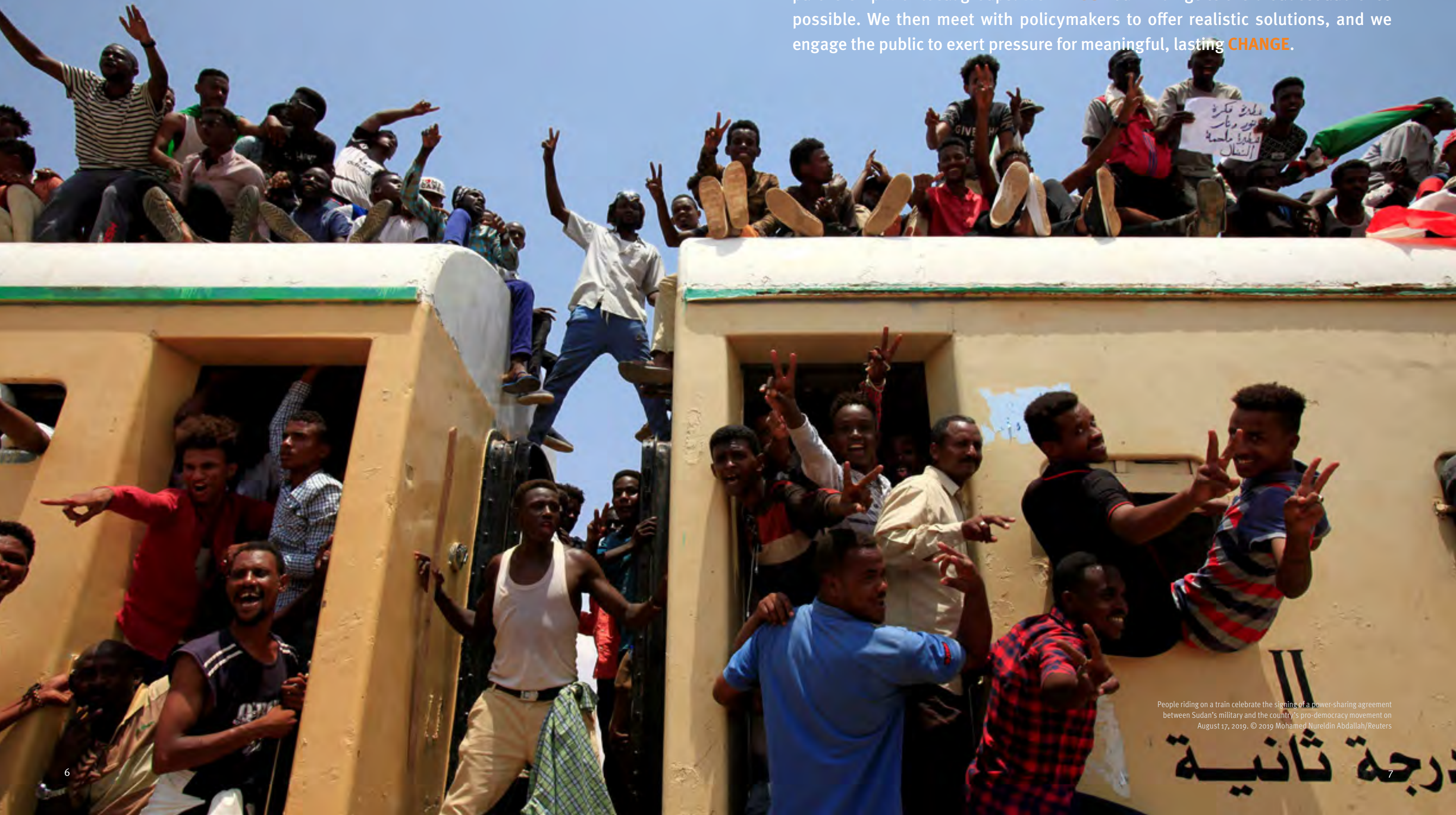
People riding on a train celebrate the signing of a power-sharing agreement between Sudan's military and the country's pro-democracy movement on August 17, 2019.

Human Rights Watch employs a powerful methodology to defend human rights. We INVESTIGATE facts on the ground in more than 90 countries—often in partnership with local groups. We EXPOSE our findings to the broadest audience possible. We then meet with policymakers to offer realistic solutions, and we engage the public to exert pressure for meaningful, lasting CHANGE .