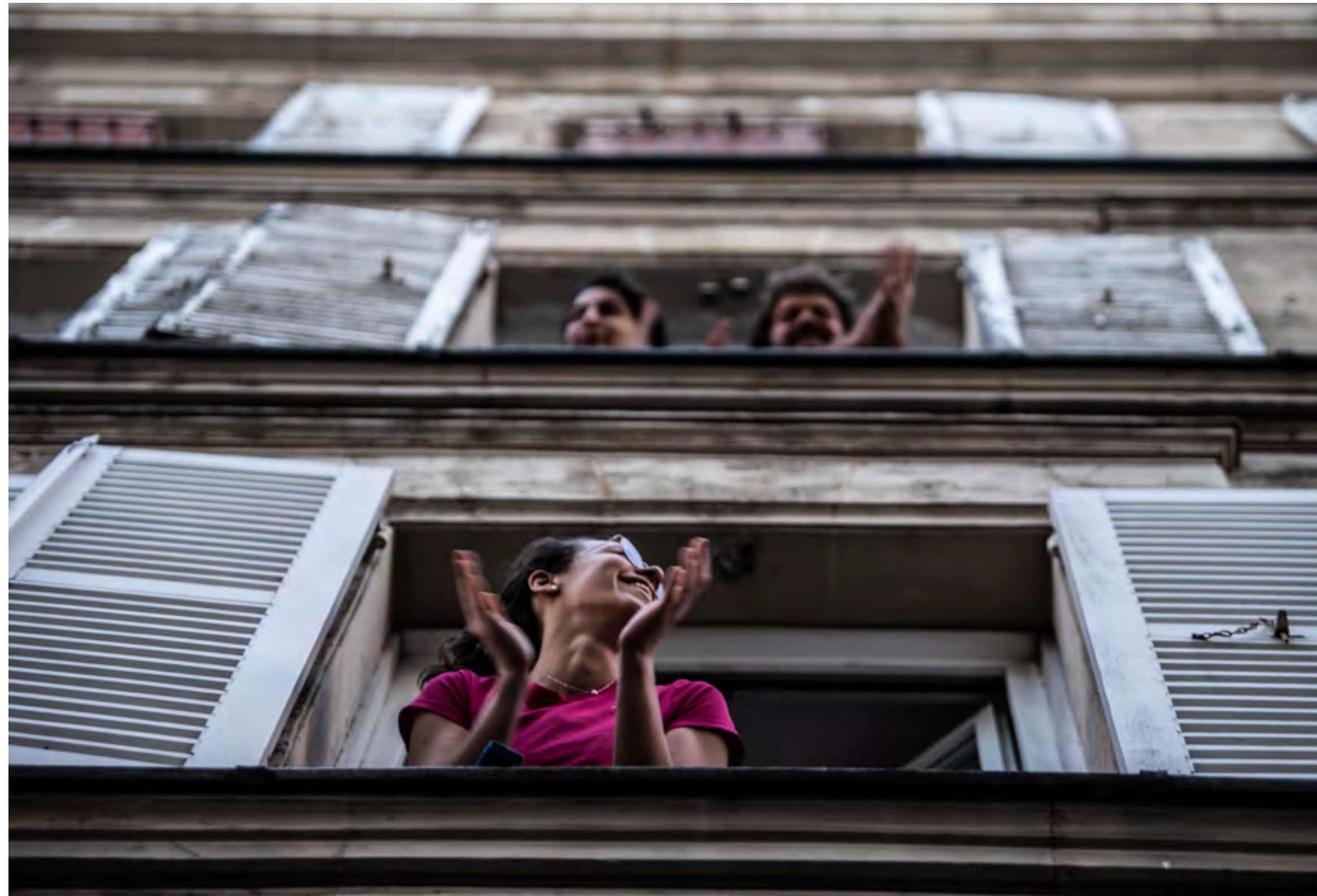
Parisians in lockdown applaud healthcare workers battling the Covid-19 pandemic in France on April 14, 2020.