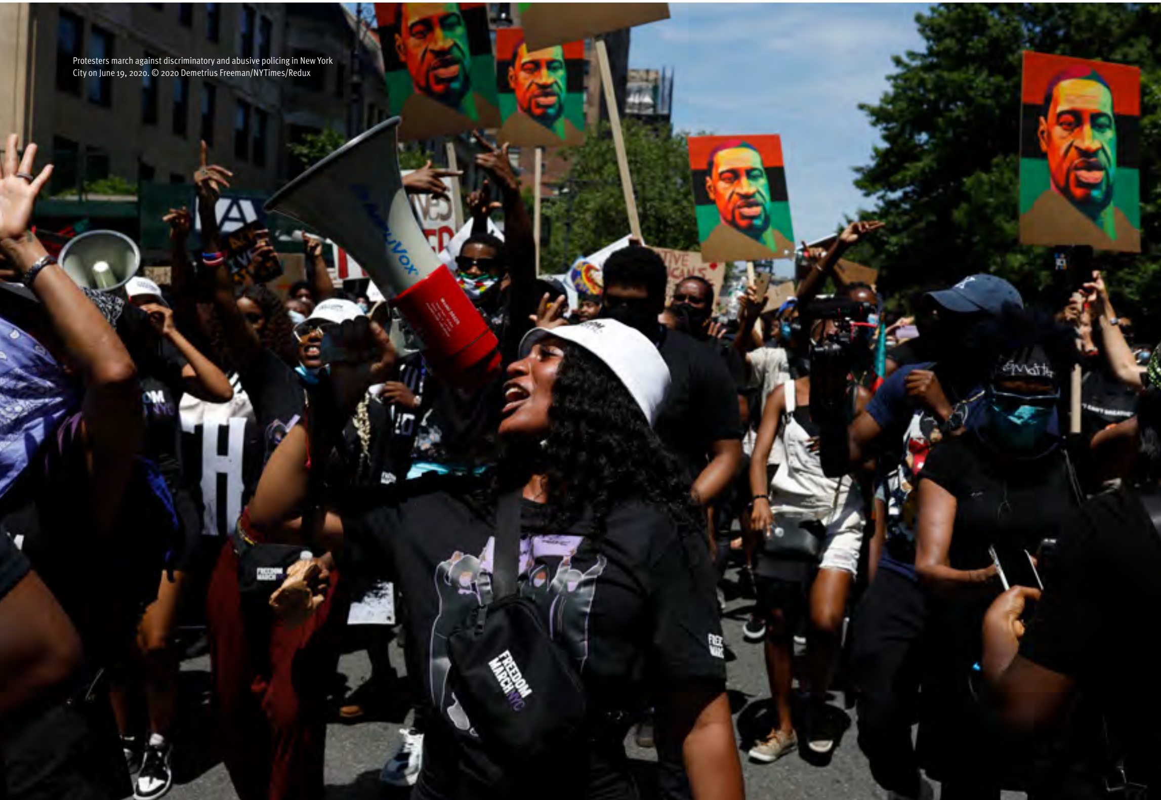
Protesters march against discriminatory and abusive policing in New York City on June 19, 2020.