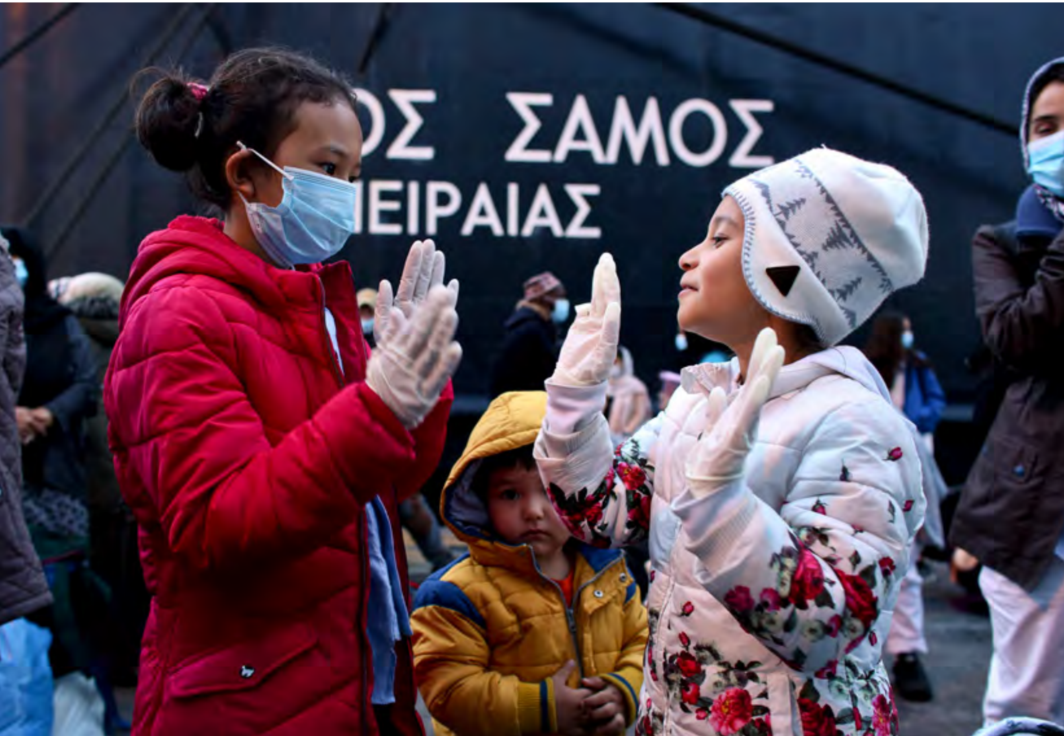
Migrant children from the Moria camp in Lesbos island play after their arrival at the port of Piraeus on May 4, 2020 in Athens, Greece.

In 2020, we faced extraordinary challenges. The Covid-19 pandemic affected all of us and placed immense strain on our healthcare systems, economies, and social structures. The pandemic also showed us how interconnected we are. We witnessed countless acts of kindness, solidarity, and support to get through these difficult times together.