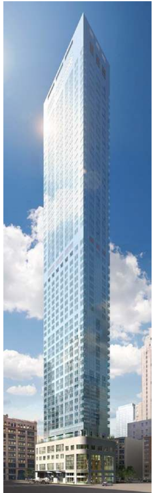
View of northwest corner