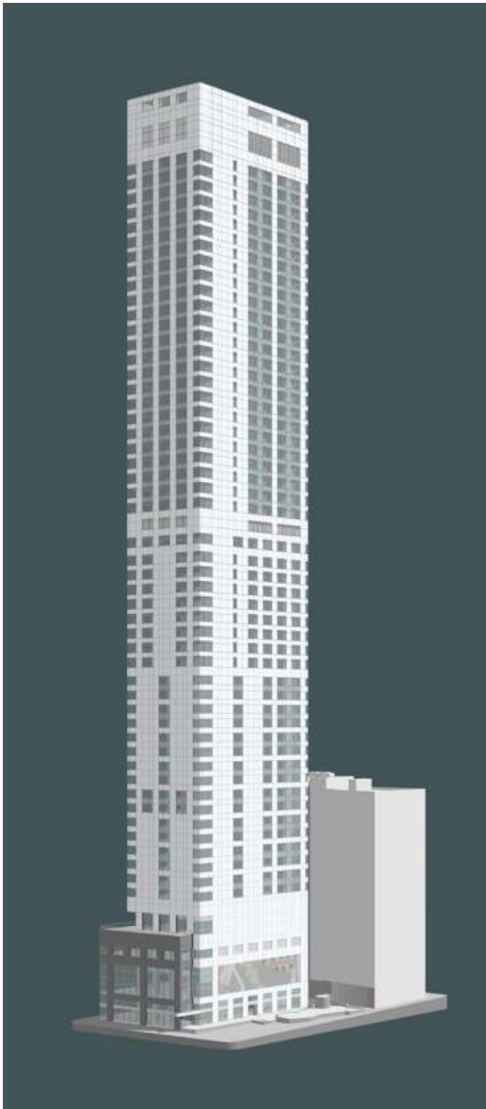
View of southwest corner