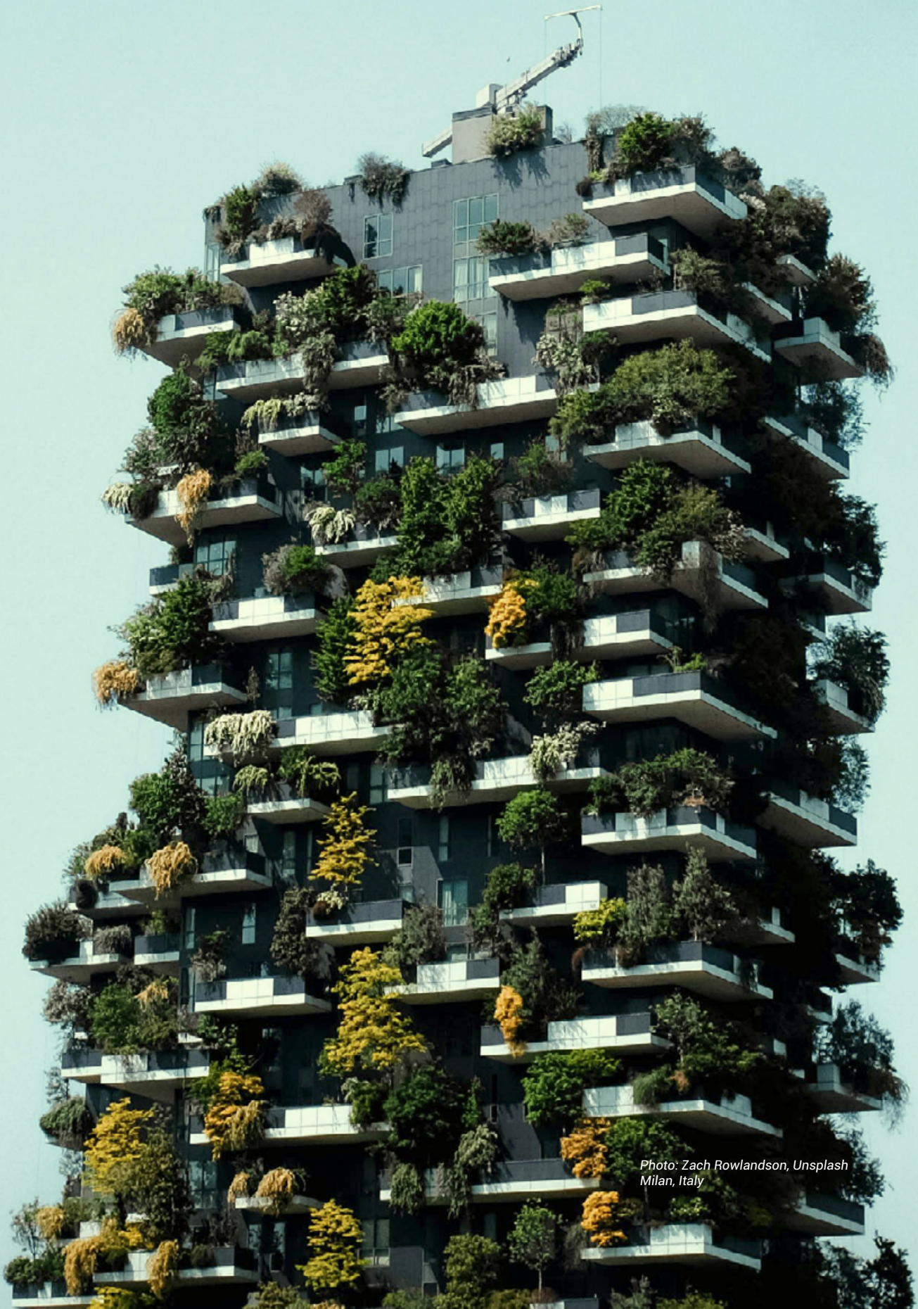
Milan, Italy