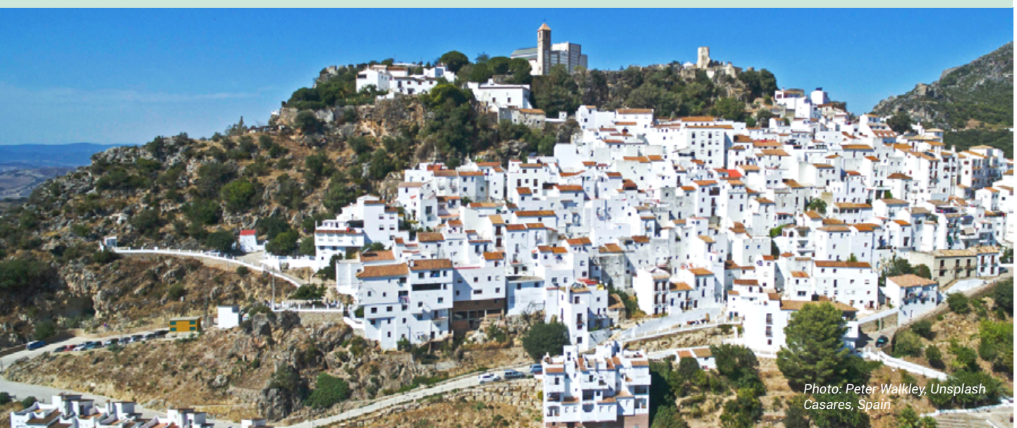
Casares, Spain

As of 2023, Spain has established 15 CTJs in 197 municipalities, showcasing their support for diverse projects to revitalize local economies and mitigate the impact of traditional energy industry closures 15 .