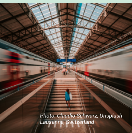
Lausanne, Switzerland

Abruzzo embarked on a pilot project with CDP to collaborate with the Municipalities of Chieti, L’Aquila, Pescara and Teramo to disclose environmental data. Only one of those cities, the Municipality of L’Aquila, had previously reported environmental data through CDP-ICLEI Track – one of the official reporting platforms under the Global Covenant of Mayors. Under the leadership of the Region, and with support from CDP, representatives of the Region and the four Municipalities held meetings at the political and technical level to commit to increasing climate action, and to collaborate on data collection and reporting. Working on their disclosure in collaboration, the Abruzzo region and four municipalities will be better able to coordinate and align between different levels of government to create a fuller picture of their climate hazards and actions to build resilience.