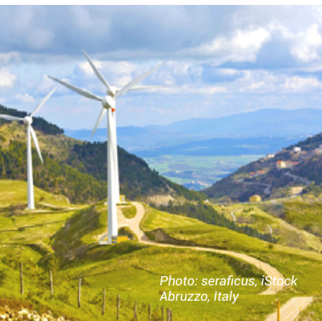
Abruzzo, Italy