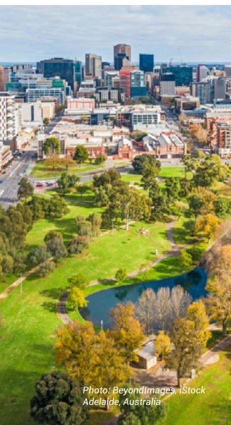
Adelaide, Australia