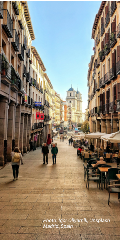
Madrid, Spain