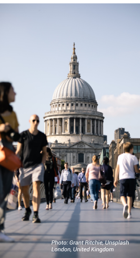
London, United Kingdom