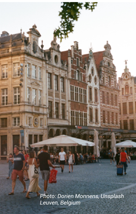
Leuven, Belgium