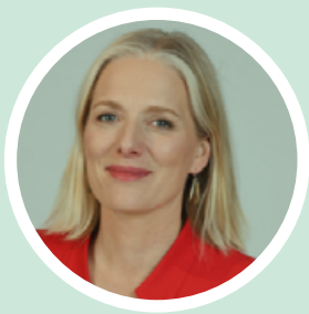
The Honourable Catherine McKenna Chair, High-level Expert Group on the Net Zero Emissions Commitments of Non-State Entities

We must not limit this dedication to subnational leadership alone, however. We must demand the same level of commitment from business and national governments. The eyes of the world are upon us, and the future of our planet hinges on our collective efforts. Together, we must rise to the occasion and deliver on our shared responsibility to safeguard the well-being of current and future generations.