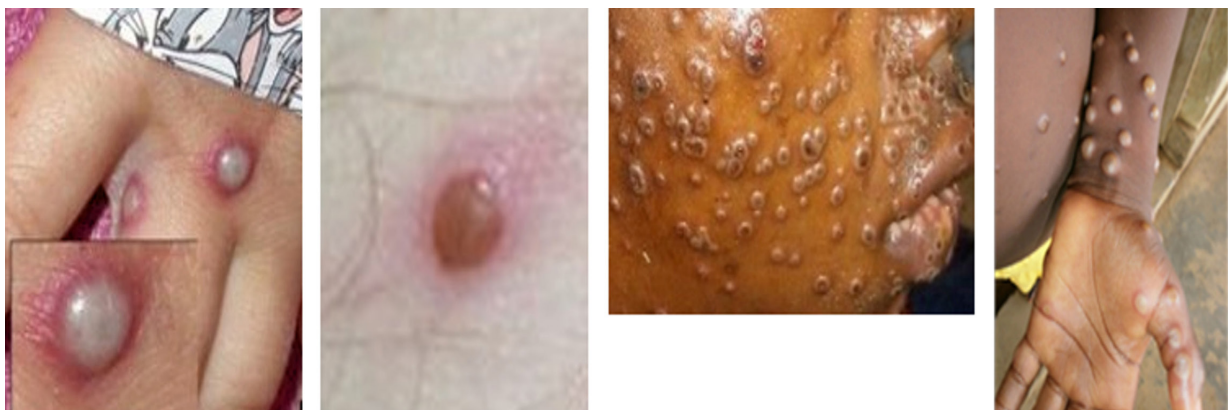
Figure 4. Different stages of lesions of monkeypox – courtesy CDC.

Monkeypox is a zoonotic disease which was prevalent in Central and Western African countries spread to developed countries of Europe, North America and Australia in the last two decades. Monkeypox is similar to smallpox on ba-