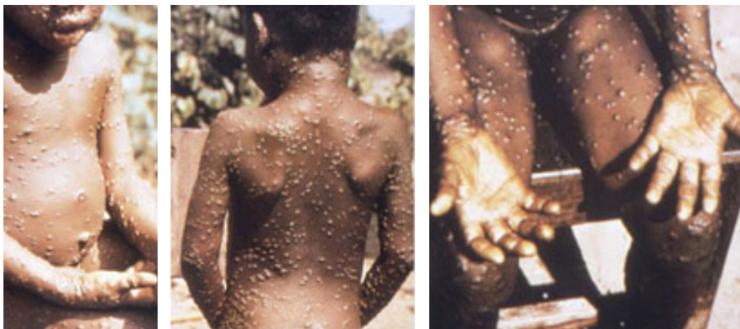
Figure 2. African child with lesions of monkeypox – courtesy CDC.

The difference observed between the old monkeypox cases and the recent monkeypox mainly lie in the mode of acquisition, all other aspects remain the same. Recent monkeypox cases outbreak in Europe included sexual transmission too apart from other modes of transmission. Monkeypox cases were observed predominantly in homo-