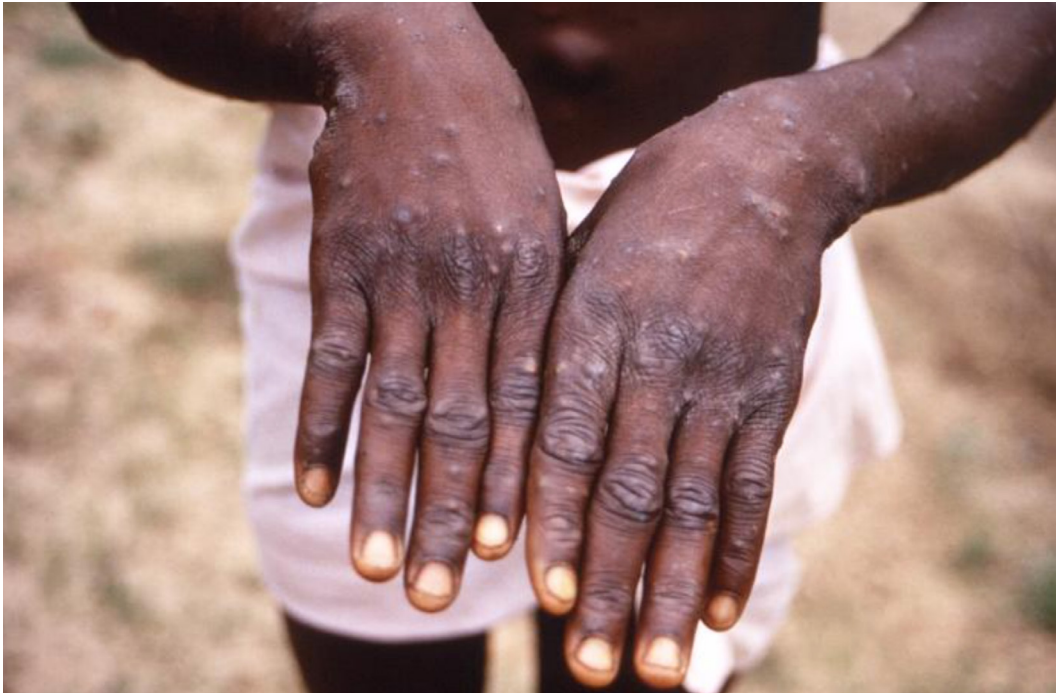
Figure 5. Monkeypox patient showing resolving lesions on the dorsal surfaces of the hands – courtesy PHIL-CDC.

sis of genetics and antigens, so vaccination with vaccinia can prevent monkeypox or reduce the severity of the disease. Monkeypox can cause severe life-threatening disease. The mode of transmission is by various ways such as from animals, direct/sexual contact, respiratory secretions or through the active lesions. Despite with 99.5% genetic similarity between the Western African and Central African strains, the Central African strain is comparatively very virulent with high mortality. To conclude monkeypox should be considered as a reemerging disease. It is necessary to prevent this disease by vaccination using vaccinia. Precautionary measures like hand hygiene and the use of mask are very vital to prevent the spread.