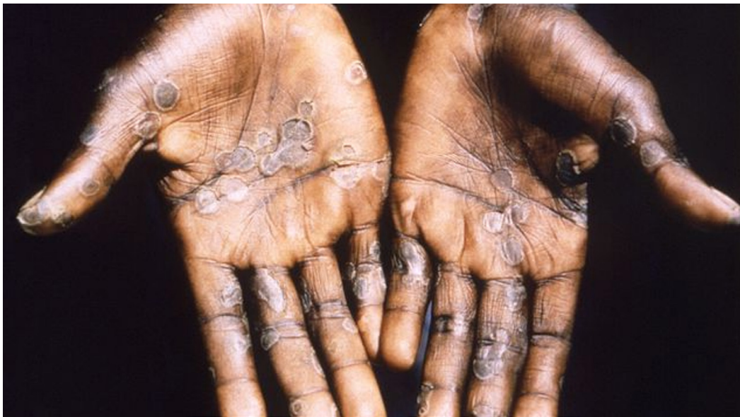
Figure 3. Scabs of monkeypox on the palms – courtesy CDC.

sexual and bisexual men due to the appearance of lesions in the genital and anal areas and the virus ability to transmit through intimate close contact 14,28,29 .