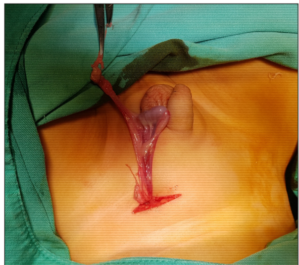
Figure 3. Dissection of the testis and relevant tissues.

Cases of the unilateral undescended testis with palpable testis in the inguinal canal were