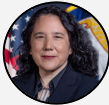
ISABEL CASILLAS GUZMAN Administrator for the United States Small Business Administration