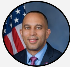
CONGRESSMAN HAKEEM JEFFRIES

President & CEO Global Black Economic Forum