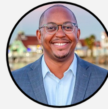
MAYOR REX RICHARDSON Mayor of Long Beach, California