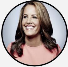
SUZANNE MALVEAUX: MODERATOR Broadcast Journalist