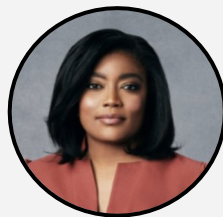
RASHIDA JONES President of MSNBC