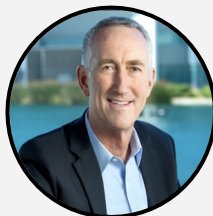
DANIEL O'DAY CEO of Gilead