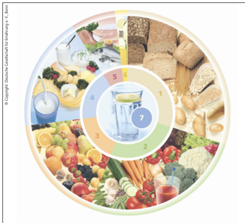
Figure 1: DGE Nutrition Circle

The special feature of the current DGE Nutrition Circle is that it is segmented on the basis of the calculated quantities of food. The segments represent the relative quantities of the different food groups which are required for an adequate and well balanced diet.