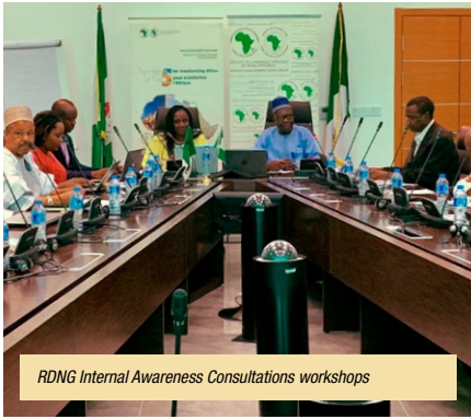
RDNG Internal Awareness Consultations workshops