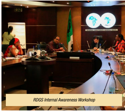
RDGS Internal Awareness Workshop