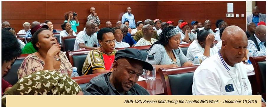
AfDB-CSO Session held during the Lesotho NGO Week – December 10, 2018