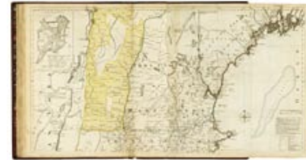
1776 Jefferys, Thomas. A Map of the Most Inhabited Part of New England, Containing the Provinces of Massachusetts Bay and New Hampshire. London: Sayer and Bennett. 53 x 99 cm. Scale 1:440,000. In: Jefferys, Thomas. The American Atlas, or A Geographical Description of the Whole Continent of America . List no. 0346.017. Page 112