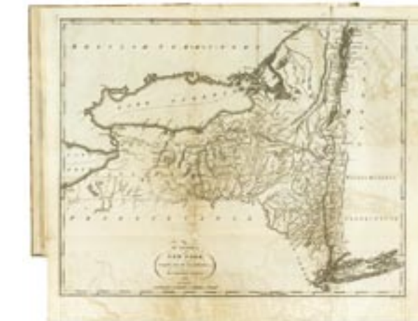
1795 Lewis, Samuel and Carey, Mathew. The State of New York Compiled from the Best Authorities. Philadelphia: Mathew Carey. 41 x 51 cm. Scale 1:1,330,560. In: Carey, Mathew. Carey's American Atlas . List no. 2542.008. Pages 40–41