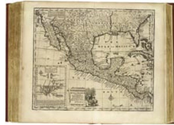
1747 Bowen, Emanuel. A New & Accurate Map of Mexico or New Spain Together with California, New Mexico &c. London: William Innys [et al.]. 35 x 42 cm. Scale 1:11,000,000. In: Bowen, Emanuel. A Complete System of Geography . List no. 3733.057. Page 5

For more detailed versions of these images see the David Rumsey Collection Web site at www.davidrumsey.com (click on Search, Data Fields, and List Number—a unique numerical identifier—which is included in the descriptions below). Fuller bibliographic information can be found on the Web site by clicking on a thumbnail image and then on Data.