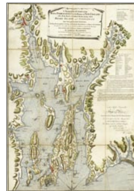
1777 Blaskowitz, Charles and Faden, William. A Topographical Chart of the Bay of Narraganset in the Province of New England, with All the Isles Contained Therein, among which Rhode Island and Connonicut have been Particularly Surveyed. London: William Faden. 93 x 64 cm. Scale 1:50,700. List no. 3951.001. Page 67