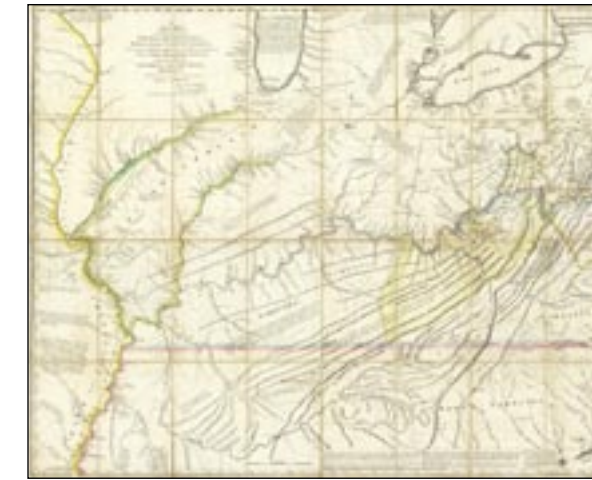
1778 Hutchins, Thomas. A New Map of the Western Parts of Virginia, Pennsylvania, Maryland and North Carolina. London: T. Hutchins. 91 x 112 cm. Scale 1:1,140,480. List no. 5044.000. Pages 64–65