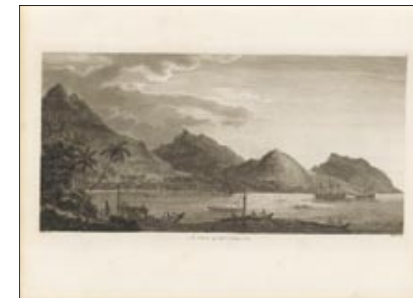
1785a Webber, John and Cook, James. A View of Huaheine. London: G. Nicol and T. Cadell. 25 x 48 cm. In: Cook, James. Voyage to the Pacific Ocean . List no. 3405.048. Pages 2–3