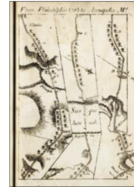
1789 Colles, Christopher. From Philadelphia to Annapolis Md. (56). New York: C. Colles. 18 x 12 cm. Scale 1:35,000. In: Colles, Christopher. A Survey of the Roads of the United States . List no. 2467.053. Page 86