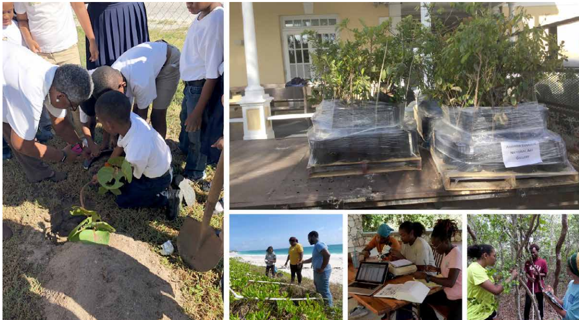
Figure 4. Initiatives like the “adopt a tree”, “forest on a pallet” and botanical field training programmes by the Bahamas National Trust and the Leon Levy Native Plant Preserve in the Bahamas are raising public awareness and providing public biodiversity education. (Photos courtesy of Ethan Freid).

Cloud-based services and programmes for data sharing, storage and digital access can provide cost-effective solutions for biodiversity monitoring. Data can be compiled and processed efficiently, and cloud computing platforms can increase the capacities to analyse large or complex data sets.