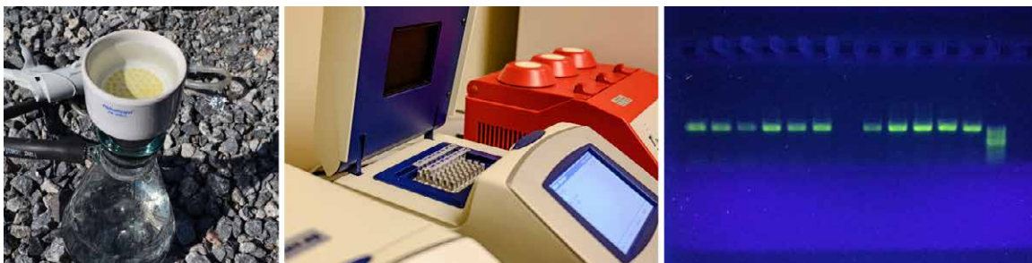
Figure 3. Researchers can collect environmental DNA in nature; PCR amplification with species-specific DNA primers can determine the species present in a water sample. Photos (left to right): environmental DNA filtration apparatus (courtesy of Katie Millette); PCR machine in the molecular genetics laboratory of the Conservatory and Botanical Garden of Geneva (courtesy of the Conservatory and Botanical Garden of Geneva); gel electrophoresis image of amplified DNA fragments (courtesy of Katie Millette).

The application of metabarcoding, metagenomics and quantitative PCR (qPCR) to environmental samples (e.g., pooled tissue and eDNA) accelerated biomonitoring, forensic sciences, such as for the detection of invasive alien species (Thomas et al. 2020) or the tracing of the illegal use of plants and animals (Staats et al. 2016). Metabarcoding and informatics are also helping us to understand the functional composition of ecological communities (Grossart et al. 2020) and reveal hidden diversity in the form of unique DNA sequences (Taberlet et al. 2012; Porter and Hajibabaei 2018). Non-destructive or low-impact sampling allow the monitoring of the genetic diversity of