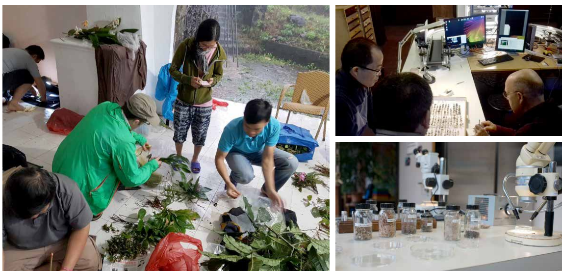
Figure 1. Examples of GTI activities. Plant specimen collection and field training in Viet Nam (left), and high throughput digitization of physical insect specimens for data integration and mobilization into international data portals (top right: photos courtesy of Thomas von Rintelen). Laboratory set-up for an outreach activity on the microscopic observation of seeds and their preservation (bottom right: photo courtesy of the Conservatory and Botanical Garden of Geneva).

incorporated directly into BLR and GBIF, including 45,000 species that have been added to the GBIF taxonomic backbone. The Barcode of Life Data System (BOLD; version 4), 12 which aims to sequence all living species on the planet, contains over 8,995,000 barcode sequences from animal, plant and fungal species, while the World Flora Online (WFO) provides descriptions, images and distribution data for over 350,510 species of land plants worldwide. All of this biodiversity data is being brought together in the Encyclopedia of Life (EOL) 13 platform to bring the vision of life on Earth into focus.