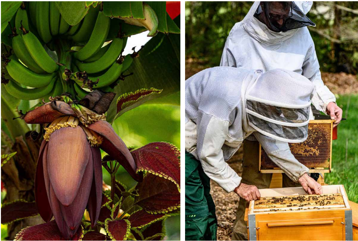
Figure 6. Left: Commercial banana ( Musa spp.) crops are threatened by a fungal pathogen. In order to support banana production, crops require constant monitoring of disease spread and the identification of disease-resistant cultivars. Right: Pollinating insects, including honeybees ( Apis spp.), are vital for plant reproduction, and information is required on their population sizes in order to maintain our global food systems and agriculture sector.

Where possible, collaborations that foster biodiversity education through “South-South” training are recommended (e.g. fellowships to learn taxonomy locally), not only the more traditional “North-South” approaches. Funding local research leads to capacity-building for both the students and the supervisors, as well as providing an incentive for researchers from different countries to create collaborative partnerships. Such programmes should be offered and managed with at least a ten-year vision. In addition, education on biodiversity data analyses and publication should be emphasized and encouraged in biodiversity-rich developing countries, where there is often a lack of published data, and fewer tools with which to conduct analyses of large data sets and publish data.