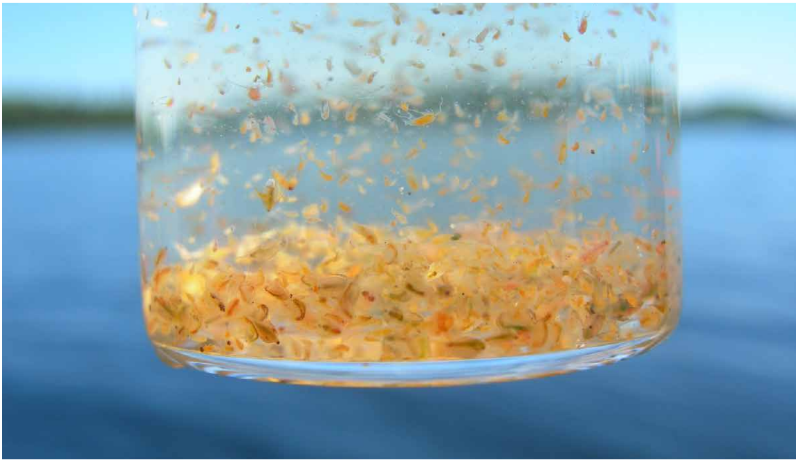
Figure 7. This collection of aquatic invertebrates can inform on the water quality of aquatic systems. The presence and absence of particular microcrustacean species, like Daphnia , can indicate water quality such as the presence of pollutants or acidic conditions.

Taxonomic research is needed in the prevention of micro-fouling and the geographic spreading of biofouling invasive aquatic species as well as the development of diagnostic tools and eradication methods for rapid response to incursions of invasive aquatic species.