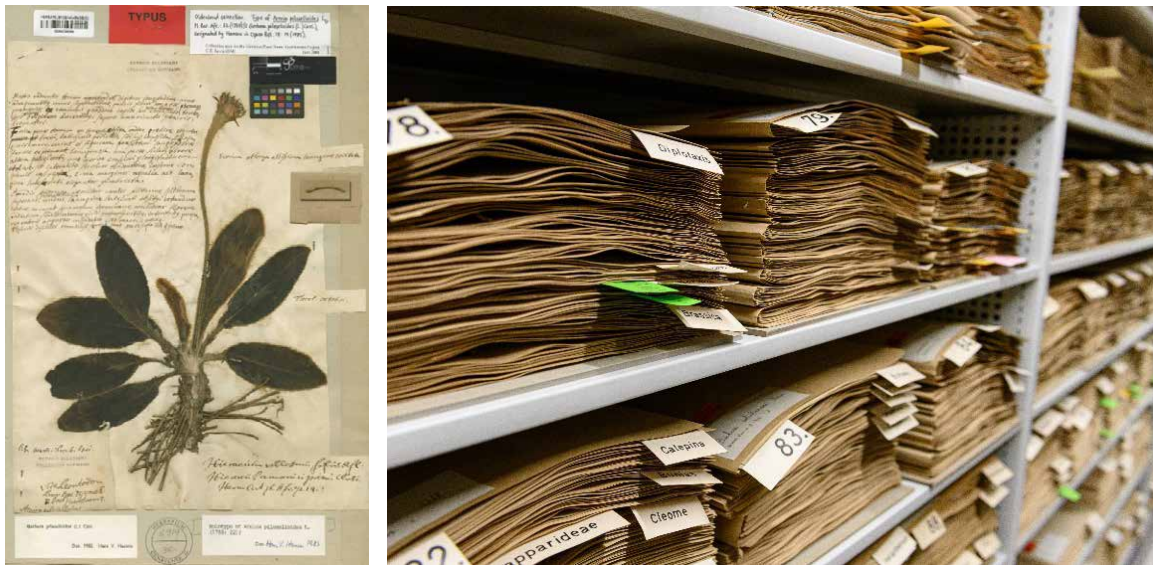
Figure 5. The herbarium of the Conservatory and Botanical Garden of Geneva houses ca. 6,000,000 specimens from around the world. This type specimen of Arnica piloselloides L. is one of many dried vascular plant specimens housed in its vast collection. (Photos courtesy of the Conservatory and Botanical Garden of Geneva).

data to other information such as environmental data (e.g. land use, pollution, temperature) are leading to new insights into the relationships between biodiversity loss and its causes. Collections are also a prerequisite for the new genomics methods, which rely on the preservation of voucher specimens as a reference for the future.