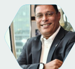
Bobby Varanasi Matryzel Consulting Sdn Bhd | Malaysia

“As IS jobs are at risk of being eliminated by automation, we need to be vigilant to ensure that it is not just about existence of a particular job type, but rather about the individual remaining in the overall economic system. Reskilling endeavors thus are crucial levers to track as part of improvements.”