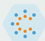
Sanaa Benchekroun Arvato | Morocco