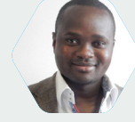
Ogylive Makova Made in Africa | Zimbabwe