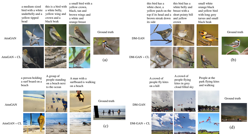
Figure 3: Comparison of example images between our approach and baselines.