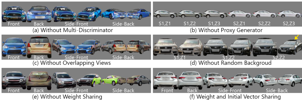
Figure 3: Ablation Study Results (a) Without using multiple discriminators the texture generator is unable to distinguish front and back. (b) Mode collapse occurs when not using the proxy image generation. (c) Inter-chart semantic consistency is lost when not overlapping the discriminator views. (d) A fixed background color (black) during training allows the generator to use this color to ignore the silhouette (yellow arrow). (e) Weight sharing is necessary to promote inter-chart consistency. (f) Without a learned constant initial vector the network cannot distinguish charts with similar silhouettes such as front and back.