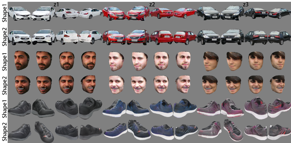
Figure 2: Rendering results of synthesized textures conditioned on the shape. For each example, we vary the shape, shown for 4 different views, over the columns ( i.e. , fixed z ) and the texture over the rows ( i.e. , different z ).