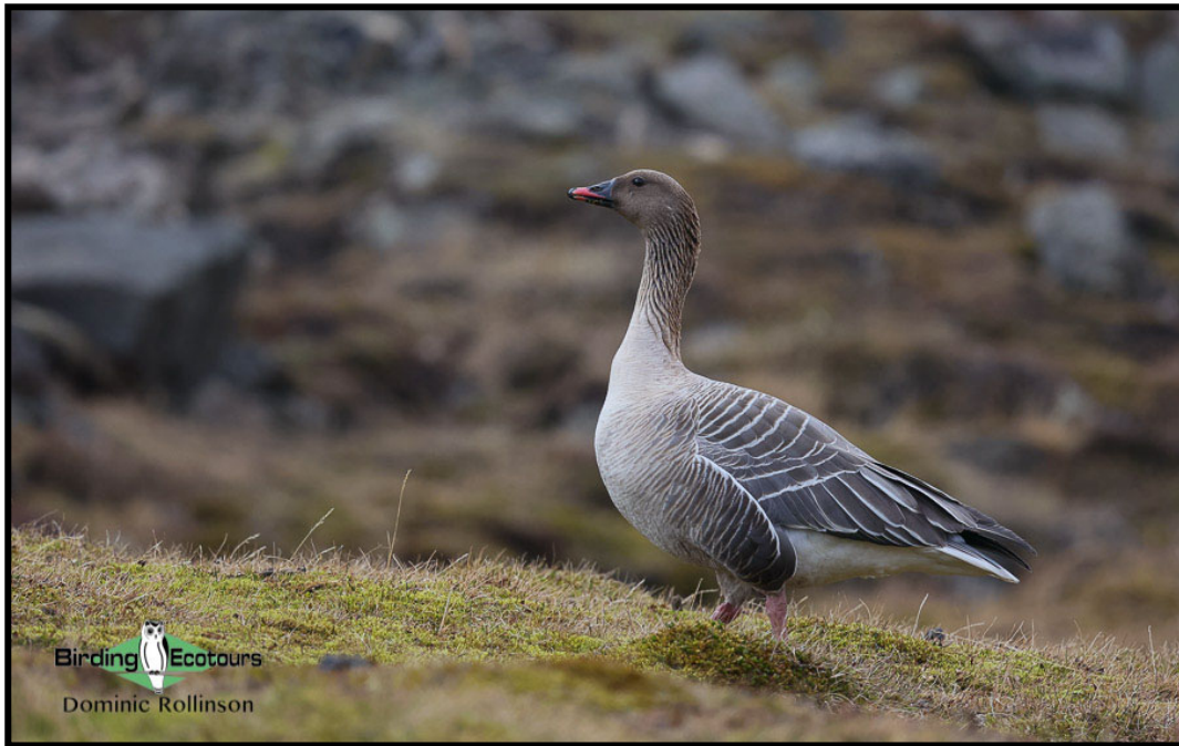
Large flocks of Pink-footed Geese may be seen in Norfolk and Suffolk.

Early in our tour we will likely see a range of common species that will become very familiar, such as Eurasian Blue Tit , Great Tit , European Goldfinch , Eurasian Bullfinch , Common Wood Pigeon , and Eurasian Magpie . We will also find our first overwintering Fieldfare and Redwing . At this time of the year many of the Common Blackbirds , Song Thrushes , and European Robins present in the UK will be of continental European origin.