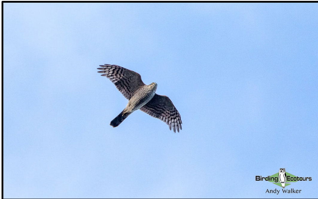
A close-quartering Eurasian Sparrowhawk , a spectacular sight!

Raptors feature heavily during this period, with several species forming communal roosts. While most of the species mentioned could be bumped into during the course of regular birding, we will look at roost sites for Western Marsh Harrier (pleasingly common these days), Hen Harrier , Peregrine Falcon , Merlin , Common Kestrel , Eurasian Sparrowhawk , and sometimes Rough-legged Buzzard (an irruptive winter visitor) or White-tailed Eagle (a species that is expanding its range in the country due to recent national reintroduction programs and an increasing, and thus wandering, population in Europe). We will also have no problem finding the spectacular Red Kite , a species that is bouncing back tremendously after years of persecution, probably one of the best-looking birds of prey in the UK. While we wait at the roost sites, we may also find some of the secretive species of the area like Short-eared Owl , Western Barn Owl , Common Crane , Eurasian Spoonbill , and Eurasian Bittern .