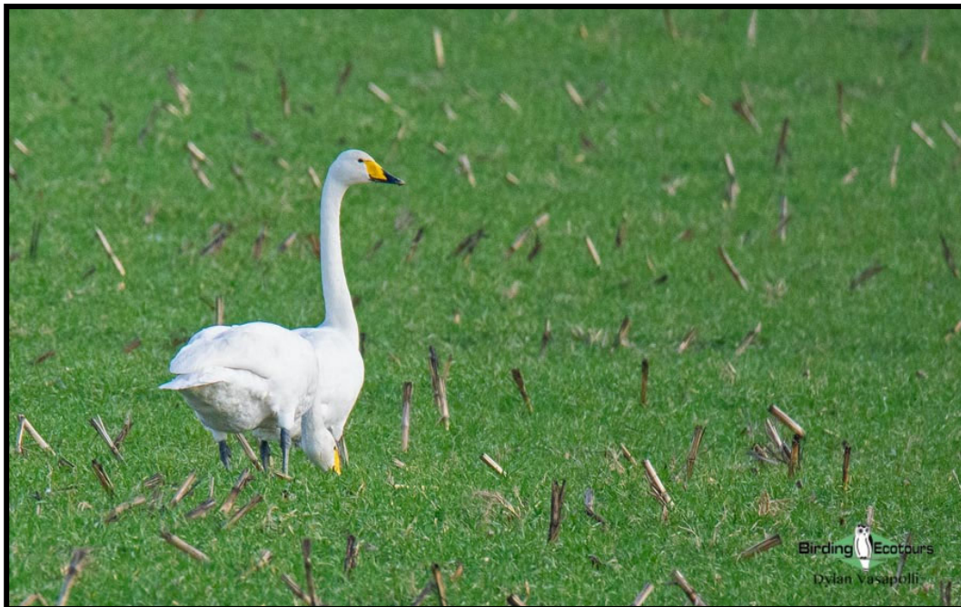
Whooper Swans are elegant winter visitors to the United Kingdom.