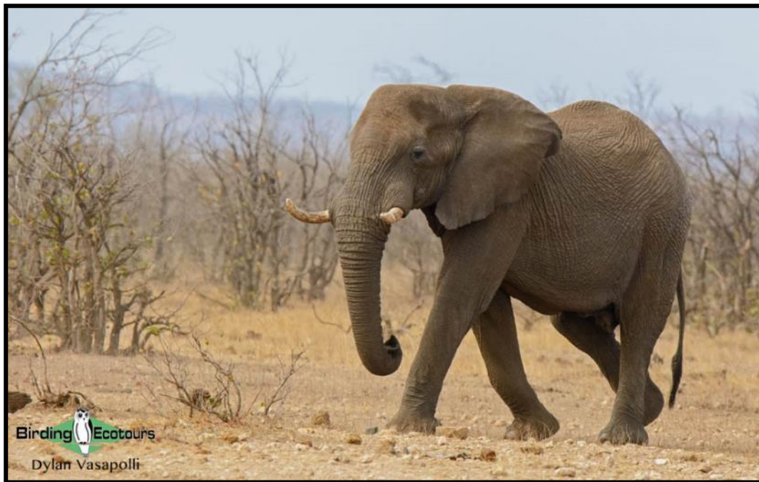
Massive African Elephants are a regular feature in the Kruger.

The tour as detailed below is great for first-time visitors to South Africa, or Africa, as it focuses on the bird-rich and mammal-rich southern parts of the Greater Kruger. We ensure we spend time in both the Kruger National Park and the exclusive Sabi Sands Game Reserve , to give you the best possible 'safari', with a combined focus on the birds and mammals. Game drives on open-sided safari vehicles, in both the Kruger National Park and the Sabi Sands are the order of our days here, as we track down as many birds and mammals as we can. In addition, this area is also relatively close to the major hub of Johannesburg, which is South Africa's largest city, and is easily accessed. The combination of a never-ending stream of mammals, including The Big 5 , and some excellent introductory African birding will leave you wanting more.