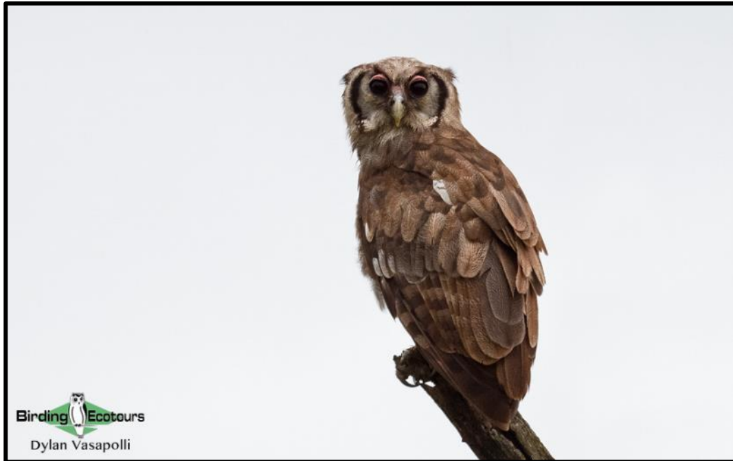
The large Verreaux's Eagle-Owl occurs in the area, often roosting in tall riverine woodland.