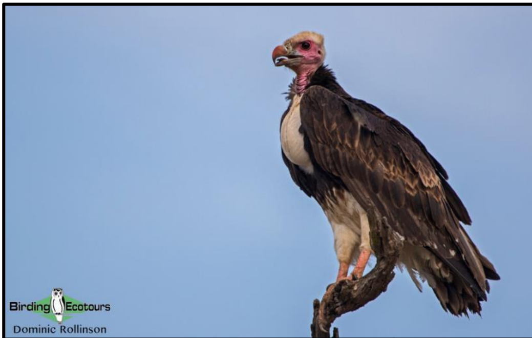
We'll keep an eye open for White-headed Vulture whilst in the Kruger.

We will also encounter a number of the 'typical' bushveld species as we traverse the park. Species that are likely include Swainson's Spurfowl , Grey Go-away-bird , Purple-crested Turaco , Red-crested Korhaan , Burchell's Coucal , Red-faced Mousebird , Green Wood Hoopoe , Common Scimitarbill , African Grey , Southern Red-billed and Southern Yellow-billed Hornbills , Lilac-breasted Roller , Brown-hooded Kingfisher , Little and White-fronted Bee-eaters , Crested Barbet , Bearded , Cardinal and Golden-tailed Woodpeckers , Brown-headed Parrot , Orange-breasted Bushshrike , Brown-crowned Tchagra , Brubru , Magpie Shrike , Black-headed Oriole , Long-billed Crombec , Burnt-necked Eremomela , Arrow-marked Babbler , Greater Blue-eared and Burchell's Starlings , Red-billed Oxpecker (often of various mammals), White-throated Robin-Chat , White-browed Scrub Robin , Scarlet-chested and Marico Sunbirds , Red-billed Buffalo , Spectacled and Lesser Masked Weavers , Green-winged Pytilia , Red-billed Firefinch , Blue Waxbill and Golden-breasted Bunting .