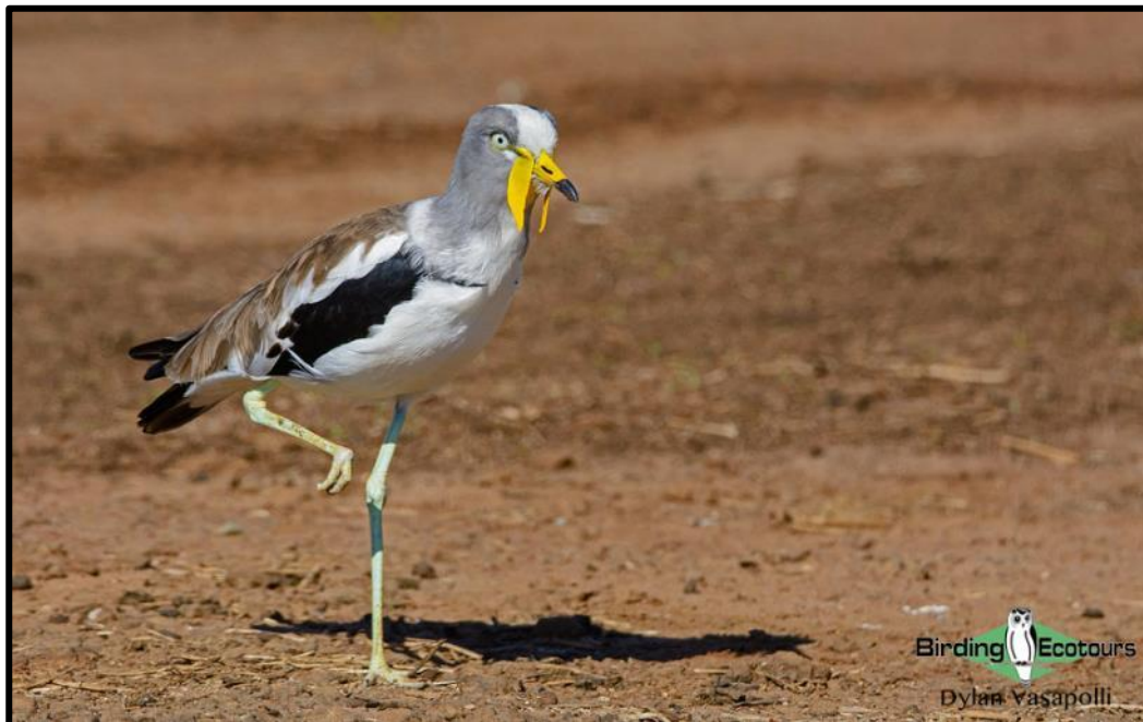
White-crowned Lapwing is localized only occurring on the larger rivers.