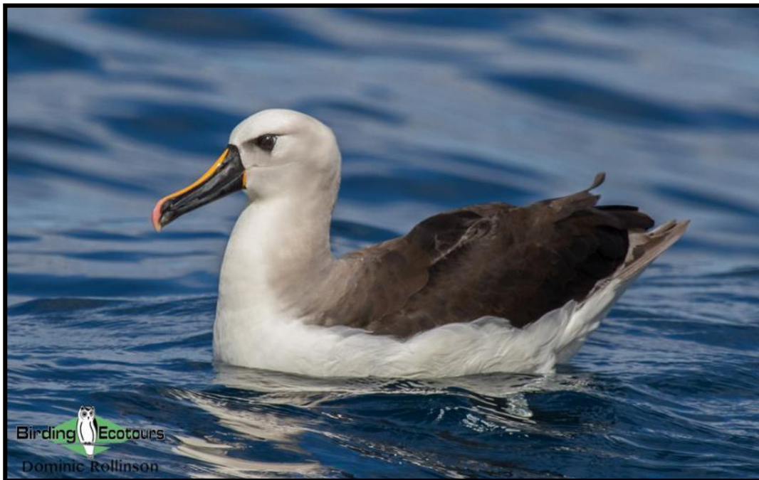
Albatrosses such as this Atlantic Yellow-nosed Albatross are usually seen on our Cape pelagic.

yet eerily beautiful, with the sharp mountains rising right from the shore. Once we start transiting away from land the serious pelagic birding soon begins as we start seeing good numbers of Sooty , Great , and Cory's Shearwaters , White-chinned Petrels , and the odd Storm Petrel ( Wilson's and European being most common). As we head farther out we will be on the lookout for trawlers, which attract huge numbers of seabirds. If we do find a trawler it normally has a cloud of seabirds behind it, particularly when the nets are being hauled in. Here we can expect to find Shy , Black-browed , Indian Yellow-nosed and Atlantic Yellow-nosed Albatrosses , Northern and Southern Giant Petrels , Cape Petrel , Brown Skua , and occasionally Great-winged Petrel . We will always be on the lookout for Spectacled Petrel , Northern and Southern Royal Albatrosses , and Wandering Albatross which, although considered rare, are seen with some frequency off the Cape.