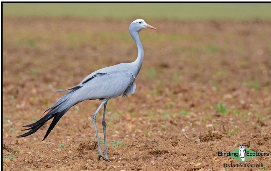
The majestic Blue Crane is commonly encountered on this tour.

Overnight: Le Mahi Guest House, Langebaan