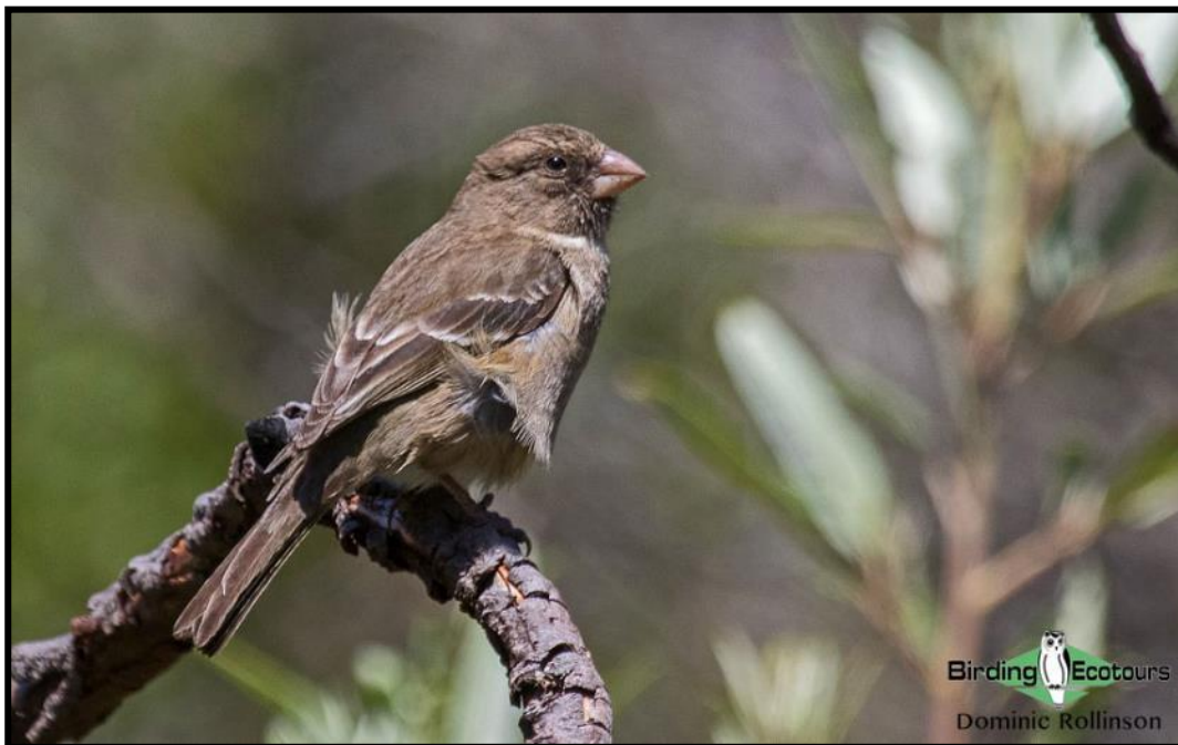
Protea Canary — a Cape endemic