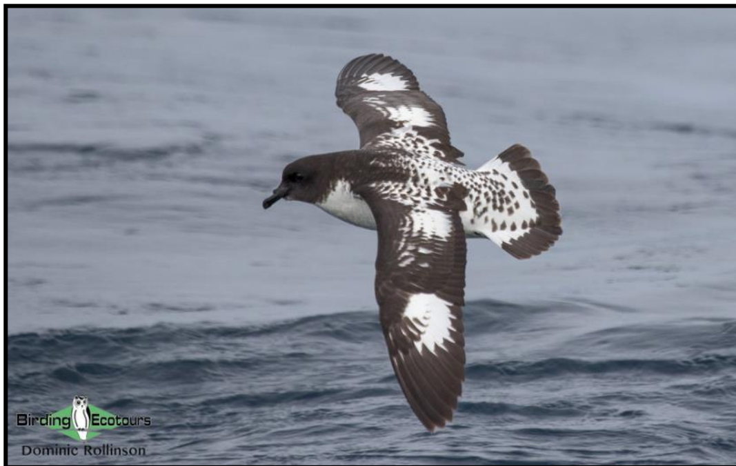
Cape Petrel is usually seen on our pelagic trip on our 8-day Cape tour.

The Western Cape is the most important endemic bird area on the entire African continent. It is a truly essential area for any serious birder because of its sheer number of endemics. Pelagic trips off Cape Town also rank as among the finest in the world (with at least four albatross species, Cape Petrel (seasonal), and many more on the rich trawling grounds near where two oceans meet). The Cape is also a spectacularly scenic area, with the rugged Cape Fold Mountains that come right down to the sea, white sand beaches, sea cliffs on the Cape Peninsula, and beautiful vineyards. Close inshore Southern Right Whales (seasonal) plus a lot of other mammals, spectacular carpets of flowers (seasonal), and the most plant-diverse biome on earth (even richer than the Amazon!) are major attractions that are easily seen incidentally, while not jeopardizing our chances of finding all the birds. We recommend at least a week in the Western Cape. The aim of our standard (set departure) 8-day tour (but we can custom-make a trip of any length) is to find a majority of the endemics of this province, with many other species as an unavoidable byproduct (plus, as always, an amazing overall experience), and of course a lot of pelagic and other seabirds. To find the endemics we budget adequate time in each strategic ecosystem – the fynbos , Langebaan Lagoon , and the Karoo .