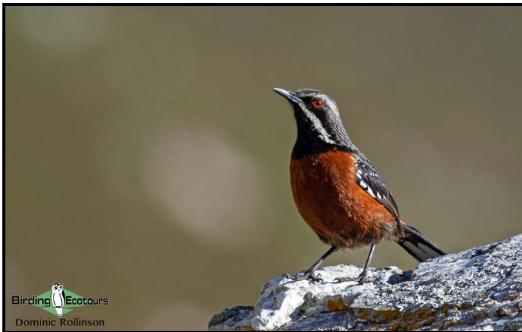
Cape Rockjumper is one of the two species making up the rockjumper family; we normally encounter it on this tour.

We begin this tour with a Cape pelagic trip, where we invariably find four albatross species and always hope for an additional rarer one like Wandering Albatross . Then we hope to encounter some very enigmatic birds: Watch a weird little warbler, a desert bird that skulks, disappear into a rock crevice, namely Cinnamon-breasted Warbler , one of the Cape's strangest endemics and one of the toughest of the many Karoo endemics to see well. Cape Rockjumper has a beautiful call, striking colors, a boisterous personality and a terribly limited distribution around Cape Town. A terrestrial woodpecker, Ground Woodpecker , and African Penguin are also found on the spectacular Cape Peninsula . What more can you possibly ask for?