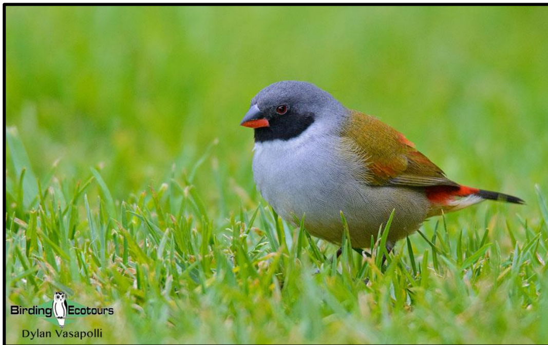
The cute and beautiful Swee Waxbill.

We then head to the small town of Betty's Bay , where we visit the picturesque Harold Porter National Botanical Garden and enjoy lunch after a walk around the gardens. In the gardens we should find African Dusky and African Paradise Flycatchers , Black Saw-wing , Swee Waxbill , Yellow Bishop , and Brimstone and Cape Canaries .