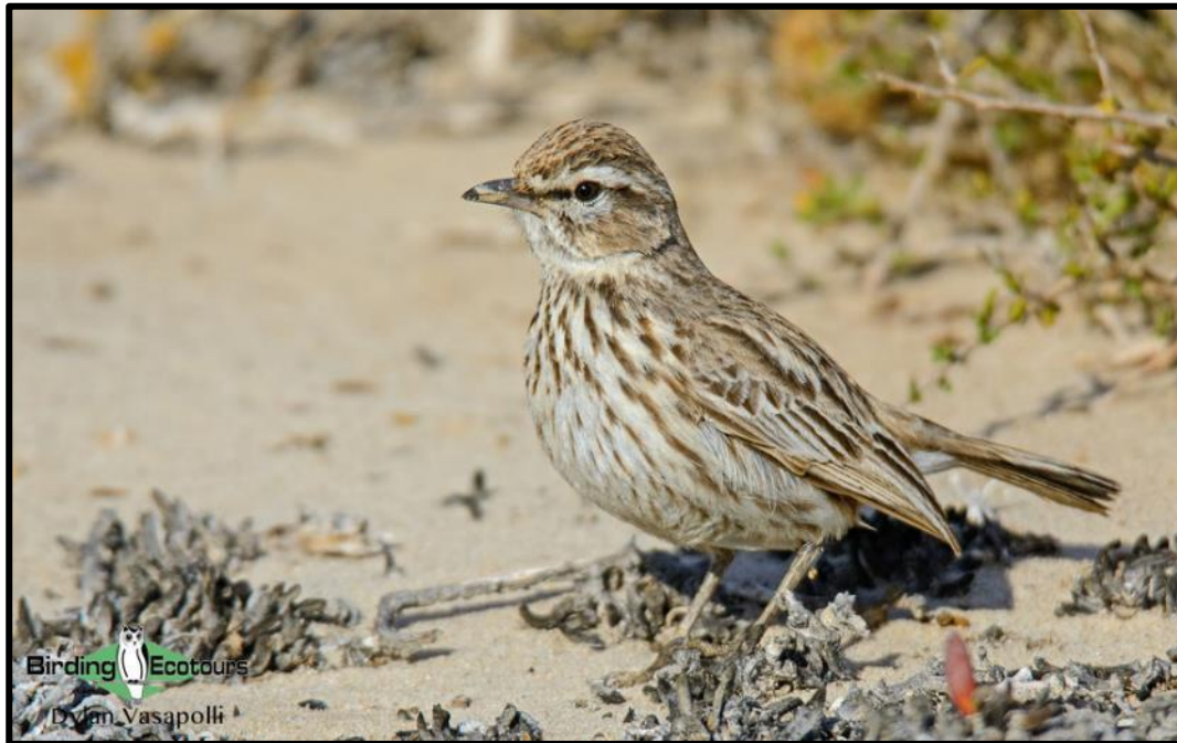
Many species occur here that have 'Karoo' in their names – such as this Karoo Lark .