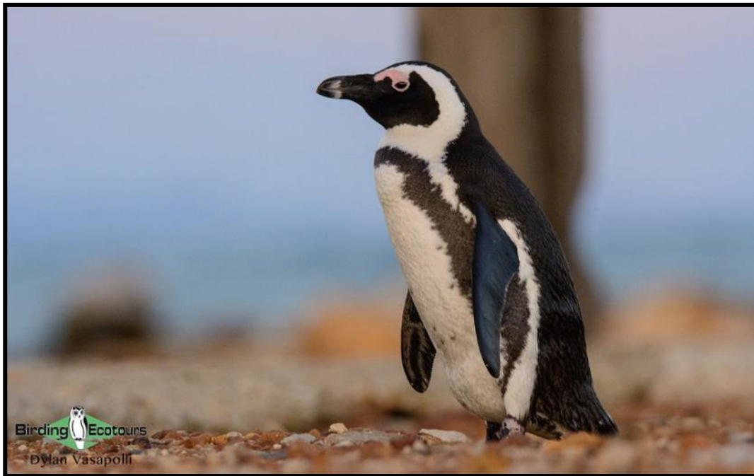
The comical African Penguin is always a highlight in any Cape birding trip!