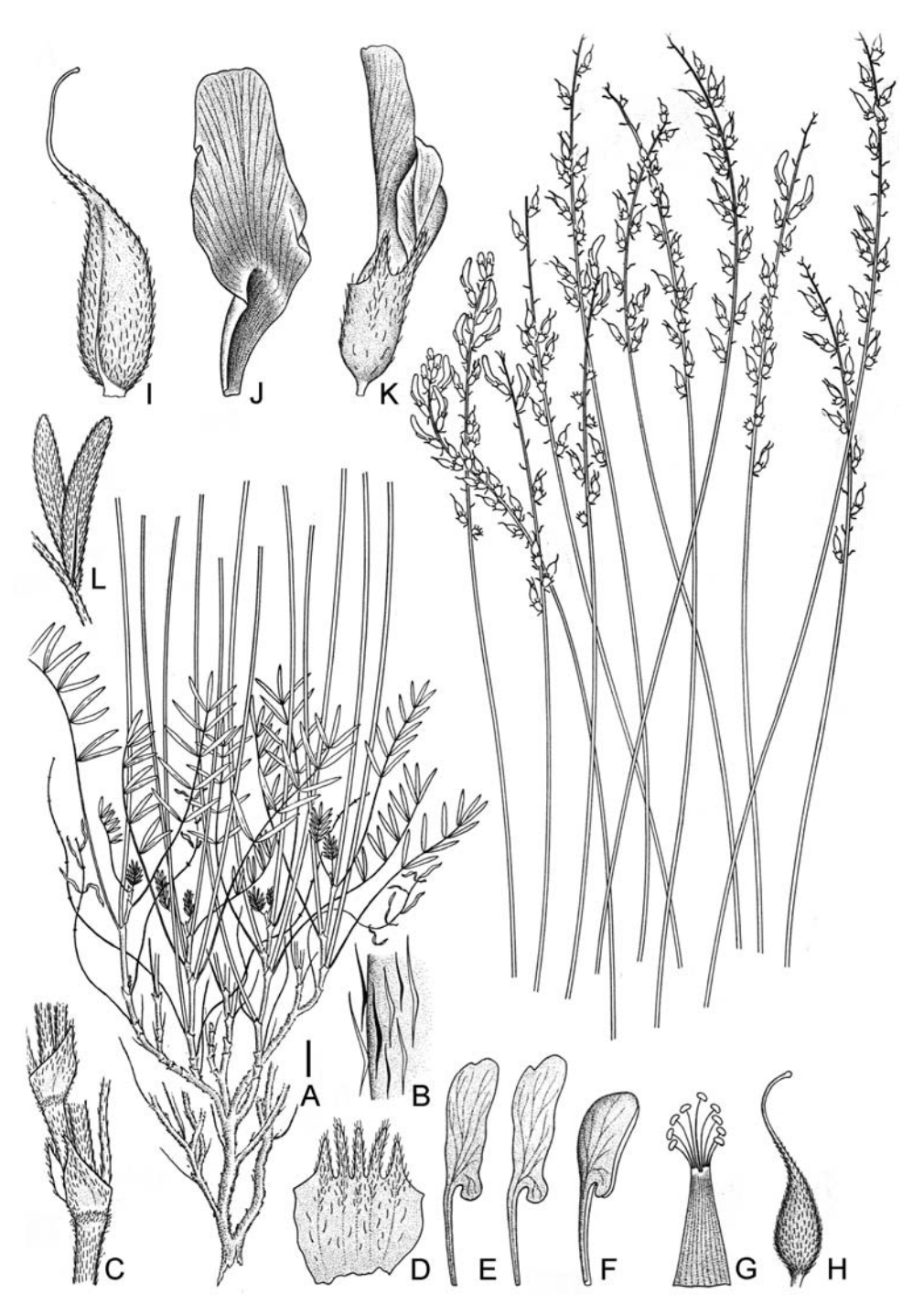
Fig. 1. Astragalus kiviensis – A: habit (with fruits); B: indumentum of calyx; C: stipules; D: calyx; E: wings; F: keel; G: androecium; H: gynoecium; I: pod; J: standard; K: flower; L: leaflet pair. – Scale bar: A = 1 cm, C, L = 2.5 mm, D-K = 1.25 mm; drawn after the type collection.