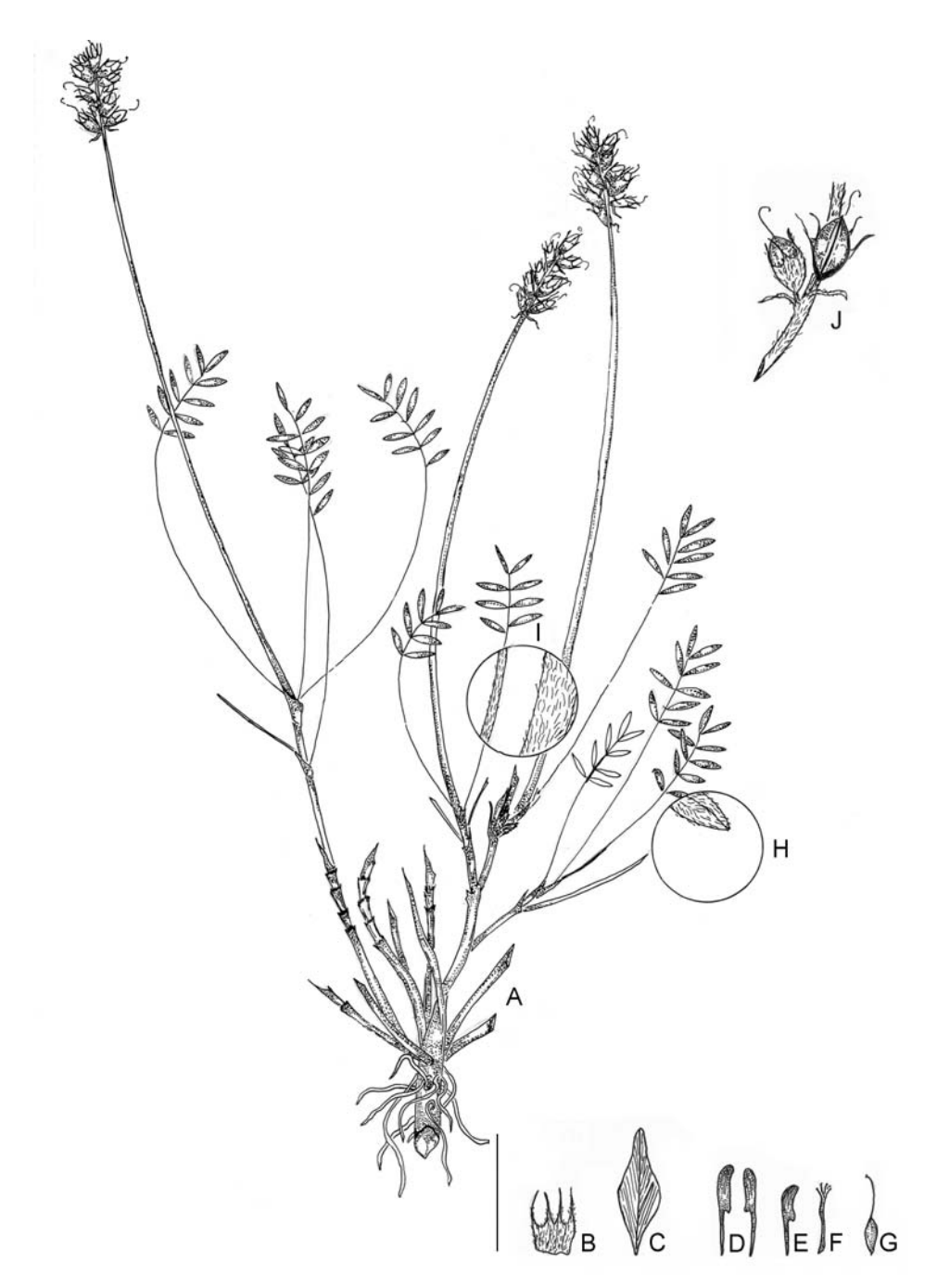
Fig. 2. Astragalus kadschoroides – A: habit (with fruits); B: calyx; C: standard; D: wings; E: keel; F: androecium; G: gynoecium; H: indumentum of leaflet; I: indumentum of rachis and peduncle; J: pod. – Scale bar A = 3 cm, B-G, J = 1.5 cm; drawn after the type collection.