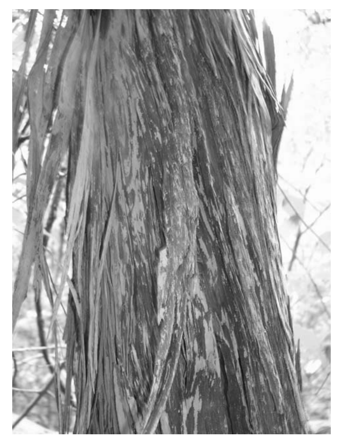
Fig. 2. Trunk of Tetrazygia decorticans, with bark peeling off in laminar shreds.

species is very rare. It occurs from 600-650 m in seasonally wet evergreen forest. Associated melastome species include: Miconia prasina (Sw.) DC., Meriania leucantha subsp. nana (Triana) Borhidi, Tetrazygia bicolor (Mill.) Cogn. and Clidemia barbeyana Cogn. Other associated species include Calyptronoma plumeriana (Mart.) Lourteig, Cyathea arborea (L.) Sm., Alsophila cubensis (Underw. ex Maxon) Caluff & Shelton, Cinnamomum montanum (Sw.) J. Presl, Ocotea leucoxylon (Sw.) Mez, Guarea guidonea (L.) Sleumer, Talipariti elatum (Sw.) Frixell, Roystonea regia (Kunth) O. F. Cook, Dendropanax arboreus (L.) Decne. & Planch., Faramea occidentalis (L.) A. Rich., Wallenia laurifolia (Jacq.) Sw., Citharexylon caudatum L., Casearia sylvestris Sw. subsp. sylvestris and Tabernaemontana ambliocarpa Urb.