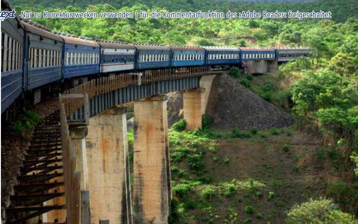
Tazara Rail - Tanza- nia-Zambia, built in the 1970s by the Chinese]]