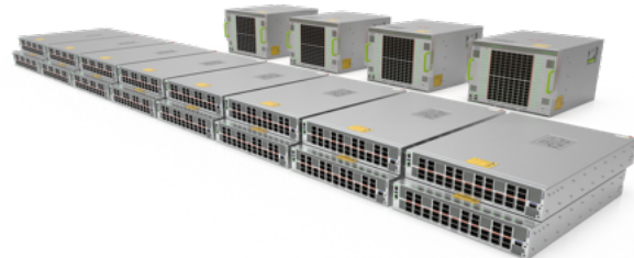
Arista 7700R Distributed Etherlink Switch

Arista Etherlink for AI adds layers of smart, workload specific functionality improving, traffic management, configuration consistency and visibility - critical factors in building, operating and troubleshooting very large clusters and minimizing downtime.