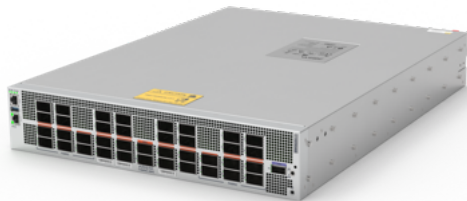
7700R4C-38PE: 38 port 800GbE Distributed Leaf Switch

Arista 7700R4 systems can be combined in various topologies to provide a choice of density, scale and speed, with linear CapEx and OpEx. 7700R4 Series systems are designed with maximum efficiency in mind, based on an advanced 5nm silicon geometry combined with optimized power and cooling design. Support for passive copper cables up to 4m and Linear-drive Pluggable Optics dramatically reduces the power and cooling footprint of very large scale networks.