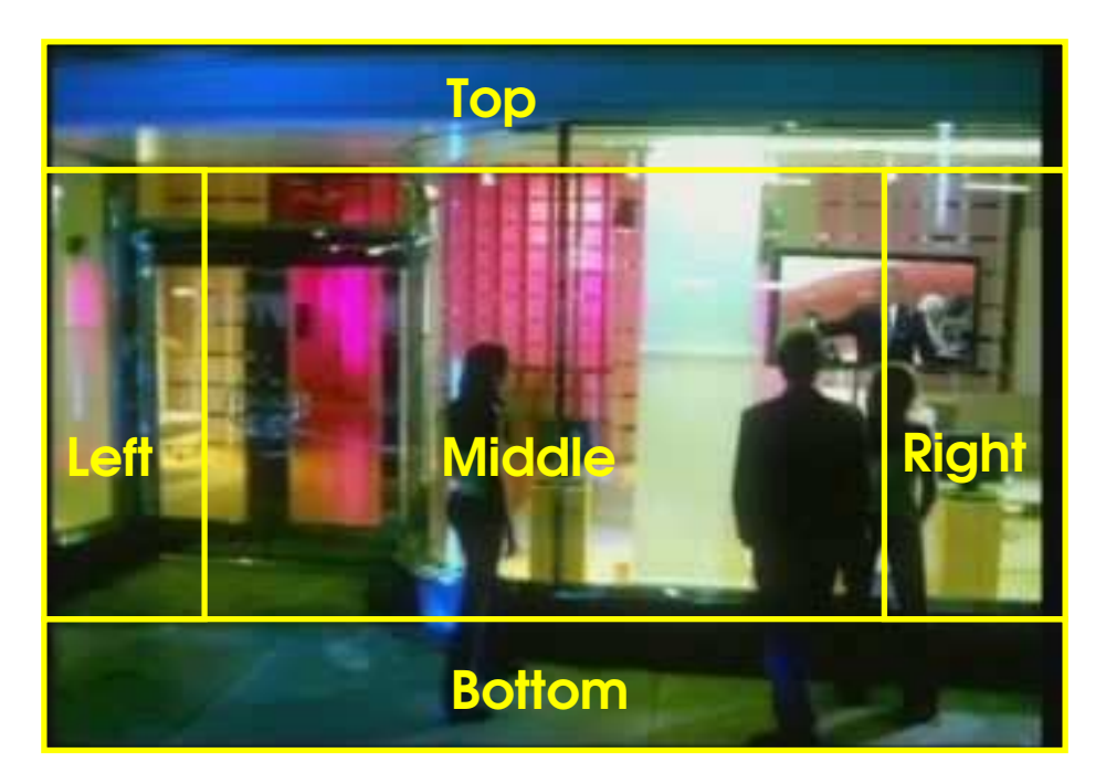
Figure 1: Spatial segmentation of a Keyframe

The Visual Information Descriptors are obtained directly and exclusively from the keyframes. In order to obtain spatial-related information, we segmented the image into 5 regions (see Figure 1). Each of them corresponds to a spatial part of the keyframe: top, bottom, left, right, and middle. The five regions do not have the same size, which reflects the importance of the contained information based on its position.