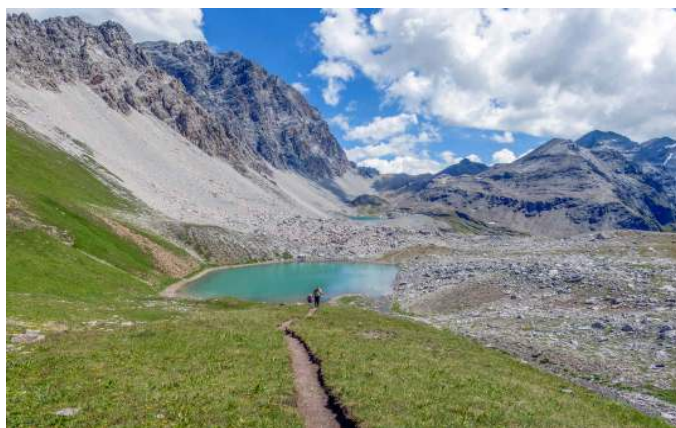
Parc Ela.

The External Relations, Public Policy and General Partnerships programme aims to advance the themes of digital and open knowledge in society and politics at the national and international levels while helping Wikimedia CH become a recognised player within the Wikimedia Movement on themes concerning our vision and strategic impact directions. We will participate in working groups and coalitions to advance digital and open-source themes in society and politics while supporting civic action groups with our own knowledge and expertise, as well as that of relevant partners.