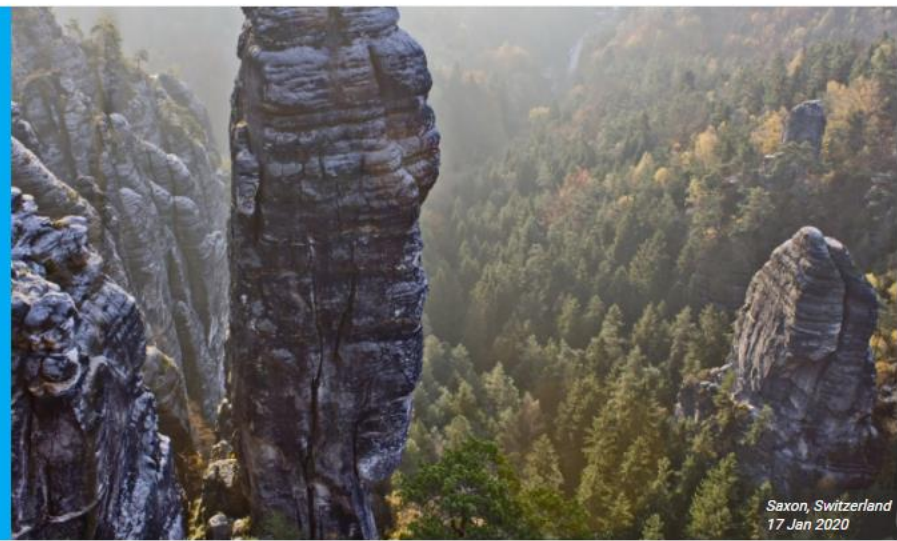
Saxon, Switzerland 17 Jan 2020