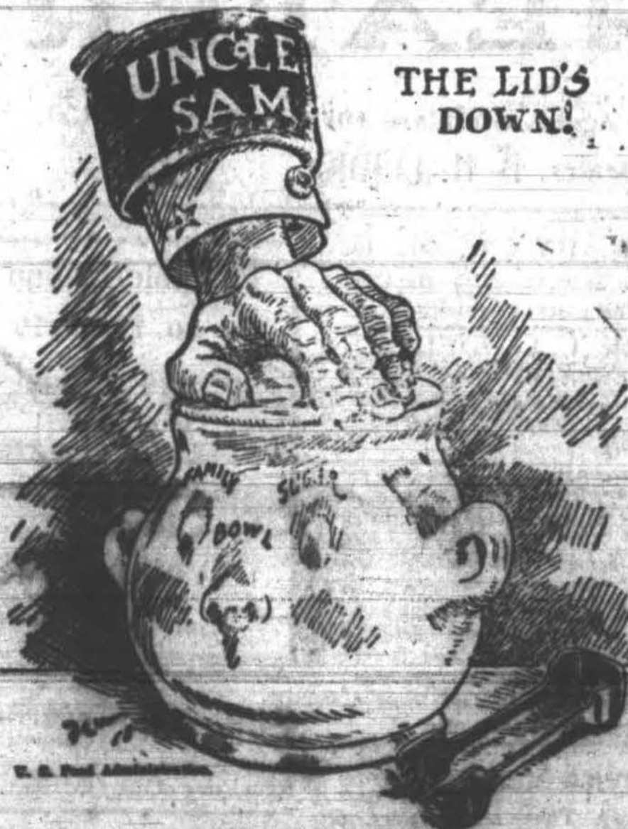
U. S. Food Administration